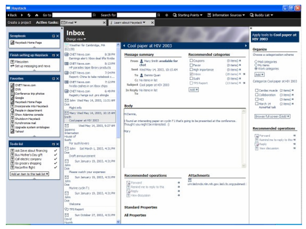
Figure 2: A screenshot of the Haystack Semantic Web Browser

[73] are under development. Swoogle can use ontologies to refine the search, and has harvested the existing ontologies and RDF data available on the Web. As yet there is a long way to go to make such tools intuitive to the general user, but in the future we can reasonably expect powerful extensions to general search engines.