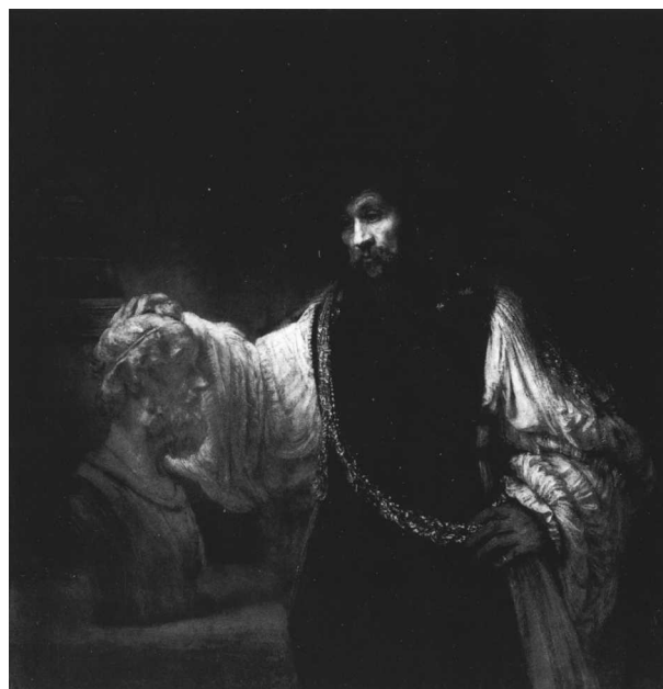
Fig. 1. Rembrandt van Rijn, Aristotle Contemplating a Bust of Homer , oil on canvas, 1653, New York, Metropolitan Museum of Art, Purchased with special funds and gifts of friends of the Museum, 1961

This man, with his sad eyes and sharply chiseled features, is seen again in one of Rembrandt's most memorable figure studies, A Bearded Man in a Cap (National Gallery, London, inv. no. 190). He was