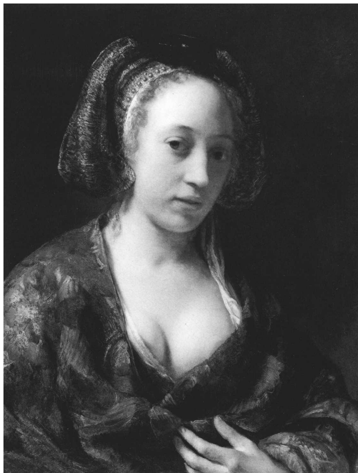
Fig. 3. Willem Drost, A Young Woman , c. 1654, oil on panel, Trustees of the Wallace Collection, London