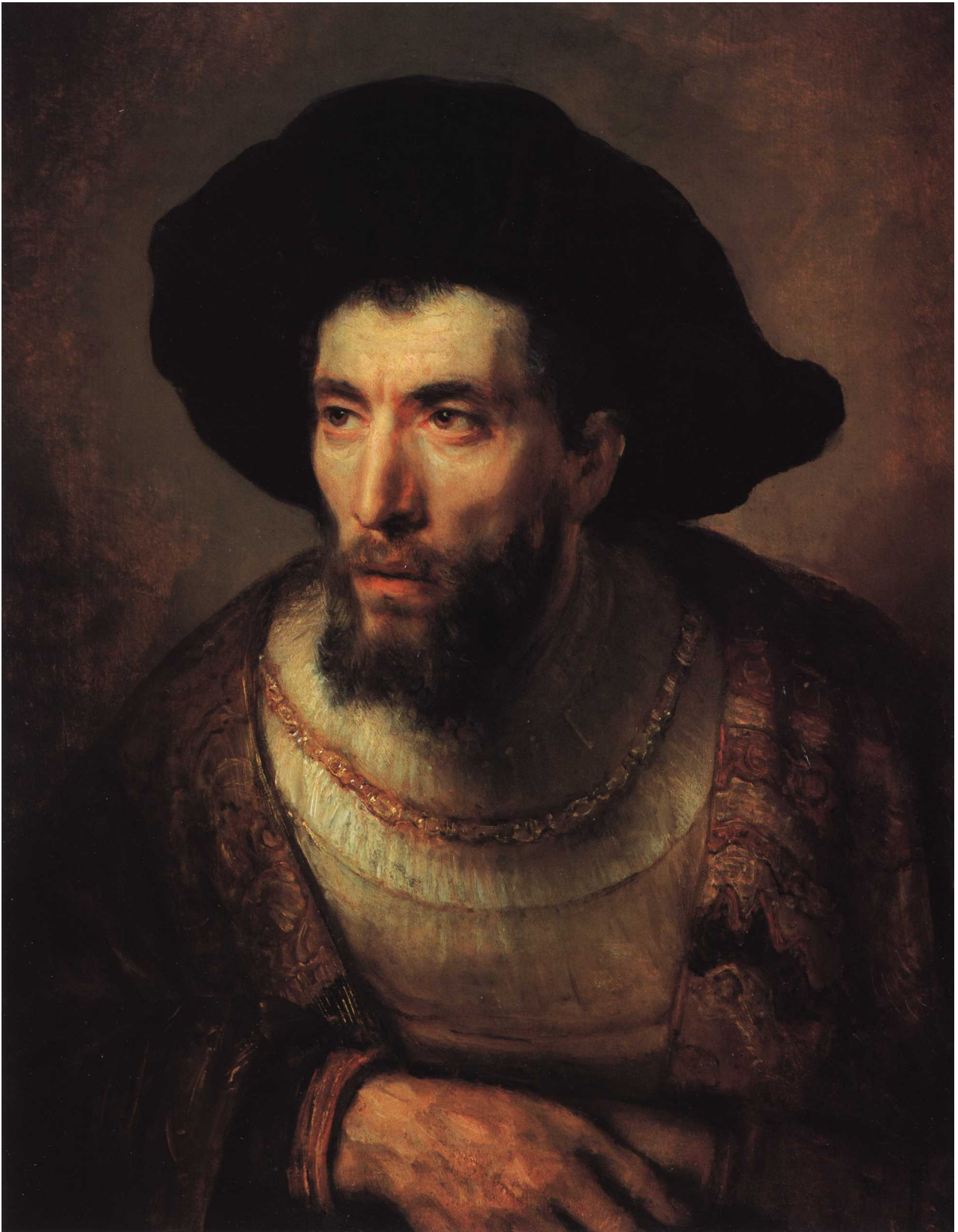
Rembrandt Workshop (possibly Willem Drost), The Philosopher , 1942.9.66