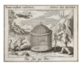
fig. 4 P. C. Hooft, "Voor vryheyt vaylicheyt," emblem from Emblemata Amatoria , Amsterdam, 1611