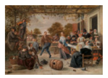
fig. 2 Jan Steen, A Terrace with a Couple Dancing to a Pipe and Fiddle, Peasants Eating and Merrymaking Behind , c. 1663, private collection (Sotheby's, London, 4 July 2007, lot 36).

fig. 1 X-radiograph composite, Jan Steen, The Dancing Couple , 1663, oil on canvas, National Gallery of Art, Washington, Widener Collection, 1942.9.81