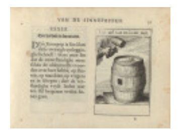
fig. 3 Roemer Visscher, "Een vol vat en bomt niet," emblem from Zinne-poppen , Amsterdam, 1614

fig. 2 Jan Steen, A Terrace with a Couple Dancing to a Pipe and Fiddle, Peasants Eating and Merrymaking Behind , c. 1663, private collection (Sotheby's, London, 4 July 2007, lot 36).