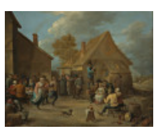
fig. 6 David Teniers the Younger, The Village Feast, 1651, oil on copper, Museum Boijmans Van Beuningen, Rotterdam.