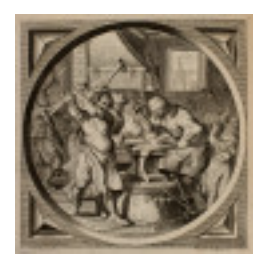
fig. 5 Jacob Cats, Spiegel van den Ouden ende Nieuwen Tijdt , The Hague, 1611