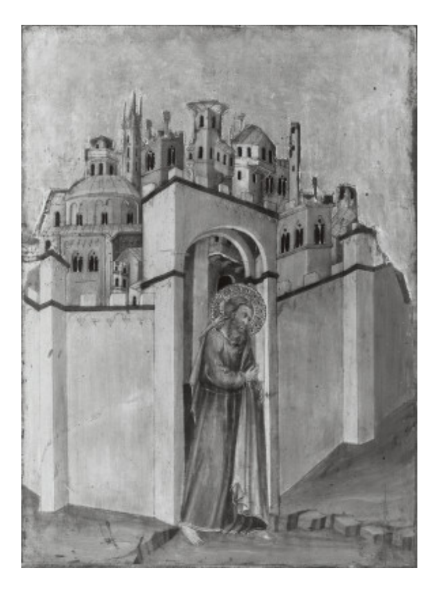
fig. 1 Andrea di Bartolo, Joachim Leaving Jerusalem , c. 1400/1405, tempera on panel, Keresztény Múzeum, Esztergom, Hungary