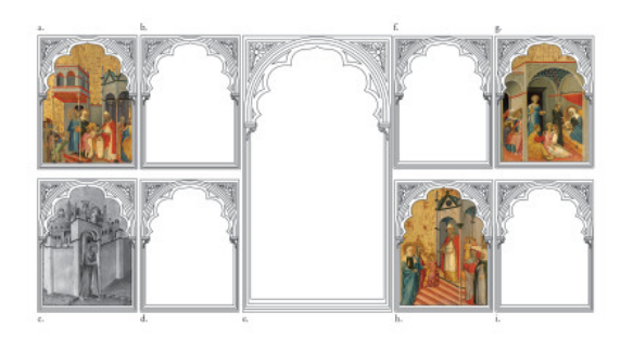
fig. 2 Reconstruction of a dispersed altarpiece by Andrea di Bartolo (color images are NGA objects): a. Joachim and Anna Giving Food to the Poor and Offerings to the Temple ; b. Expulsion of Joachim (?), lost; c. Joachim Leaving Jerusalem (fig. 1); d. Annunciation of the Birth of Mary (?), lost; e. Lost; f. Meeting at Porta Aurea (?), lost; g. The Nativity of the Virgin ; h. The Presentation of the Virgin in the Temple ; i. Marriage of the Virgin (?), lost

fig. 1 Andrea di Bartolo, Joachim Leaving Jerusalem , c. 1400/1405, tempera on panel, Keresztény Múzeum, Esztergom, Hungary