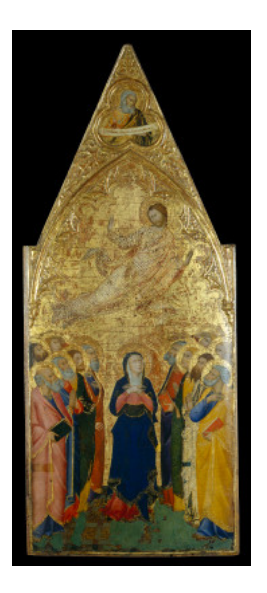
fig. 3 Andrea di Vanni, Ascension , c. 1380s, tempera on panel, The State Hermitage Museum, St. Petersburg, Gift of the heirs of Count G. S. Stroganov, 1911