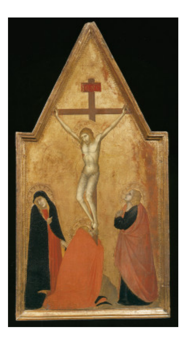
fig. 2 Pietro Lorenzetti, Crucifixion , c. 1325–1326, tempera on panel, Pinacoteca Nazionale, Siena