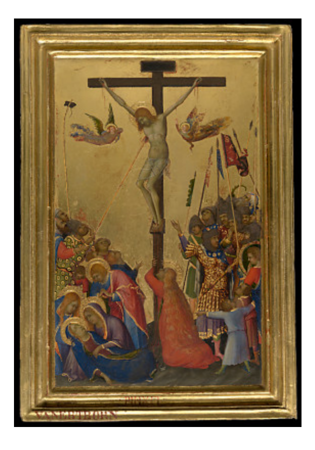
fig. 1 Simone Martini, Crucifixion (from the Orsini Polyptych), c. 1335, tempera on panel, Royal Museum of Fine Arts, Antwerp