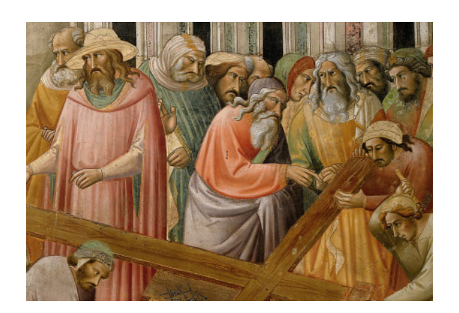
fig. 3 Detail of spectators, Agnolo Gaddi, The Making of the Cross , 1385–1390, fresco, Cappella Maggiore, Santa Croce, Florence. Image: Scala/Art Resource, NY