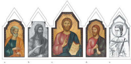
fig. 1 Reconstruction of a dispersed polyptych by Grifo di Tancredi (color images are NGA objects): a. Saint Peter ; b. Saint John the Baptist (fig. 2); c. Christ Blessing ; d. Saint James Major ; e. After Grifo di Tancredi, line drawing of a lost image of Saint Ursula