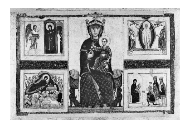
fig. 1 Margaritone and Ristoro d'Arezzo, Madonna and Child Enthroned and Four Stories of the Virgin , 1260s, tempera on panel, Santa Maria delle Vertighe, Monte San Savino (Arezzo).