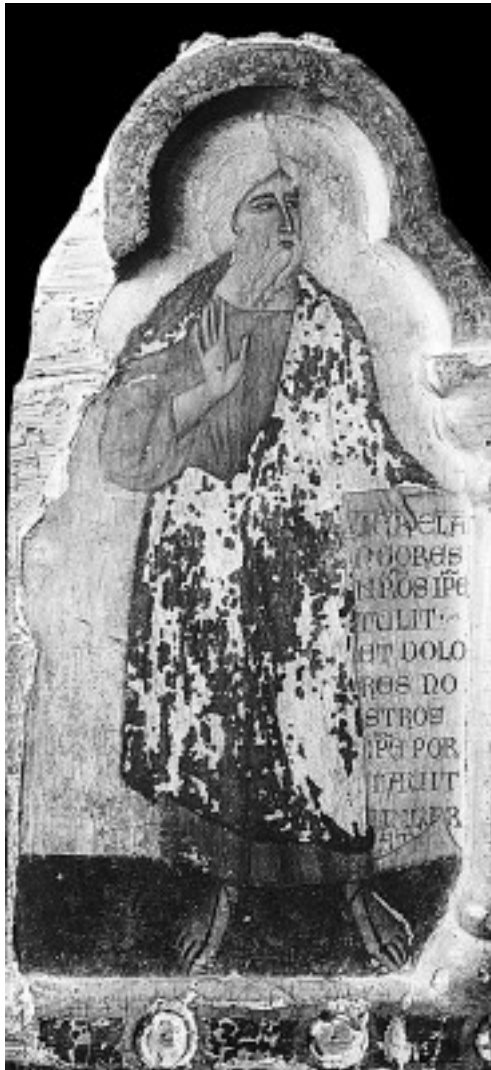
fig. 3 Master of Saint Francis, Prophet Isaiah , c. 1272, tempera on panel, Museo del Tesoro della Basilica di San Francesco, Assisi