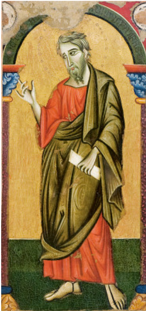
fig. 9 Master of Saint Francis, Saint Andrew , c. 1272, tempera on panel, Galleria Nazionale dell'Umbria.