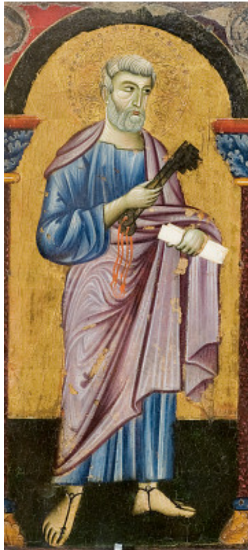
fig. 10 Master of Saint Francis, Saint Peter , c. 1272, tempera on panel, Galleria Nazionale dell'Umbria.