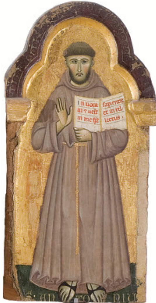
fig. 6 Master of Saint Francis, Saint Anthony of Padua , c. 1272, tempera on panel, Galleria Nazionale dell'Umbria.