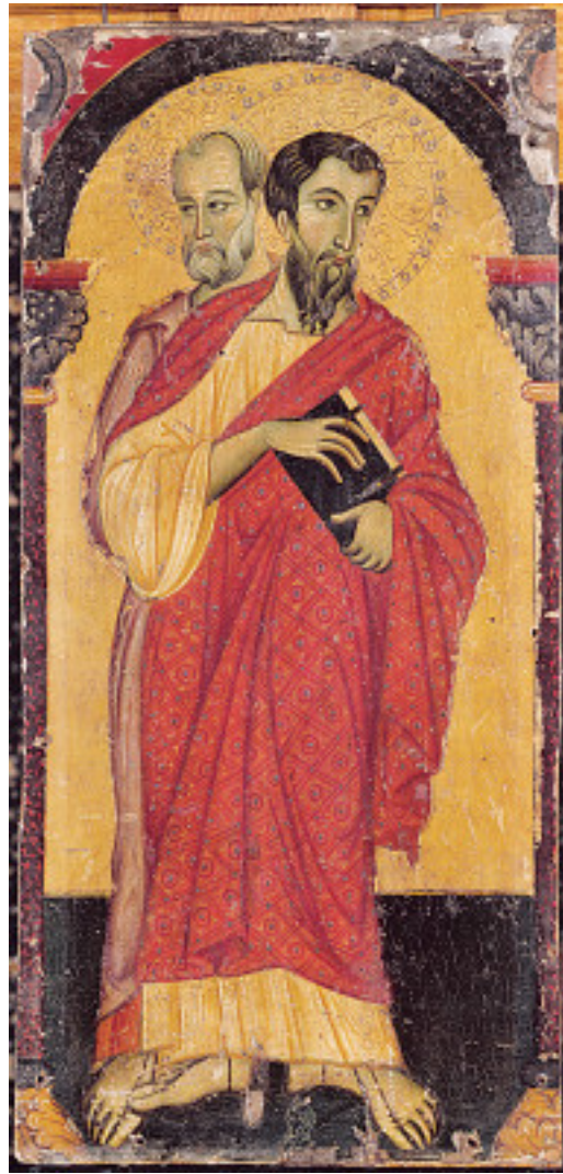
fig. 8 Master of Saint Francis, Saints Bartholomew and Simon , c. 1272, tempera on panel, The Metropolitan Museum of Art, New York, Robert Lehman Collection