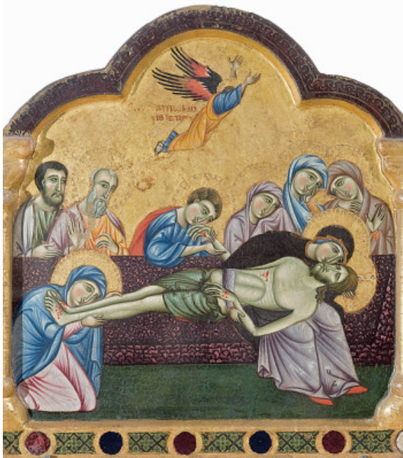
fig. 5 Master of Saint Francis, Lamentation , c. 1272, tempera on panel, Galleria Nazionale dell'Umbria.