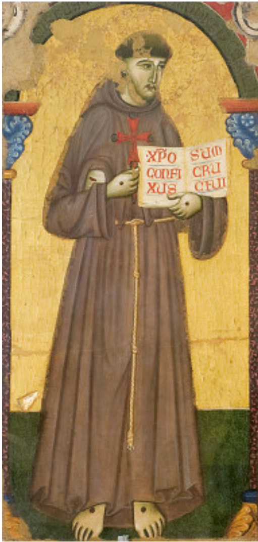
fig. 7 Master of Saint Francis, Saint Francis , c. 1272, tempera on panel, Galleria Nazionale dell'Umbria.