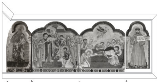
fig. 1 Reconstruction of an altarpiece formerly in San Francesco al Prato in Perugia, front side, right portion, by the Master of Saint Francis: a. Prophet Isaiah (fig. 3); b. Deposition (fig. 4); c. Lamentation (fig. 5); d. Saint Anthony of Padua (fig. 6)