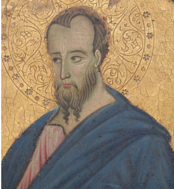
fig. 11 Detail, Master of Saint Francis, Saint James Minor , c. 1272, tempera on panel, National Gallery of Art, Washington, Samuel H. Kress Collection