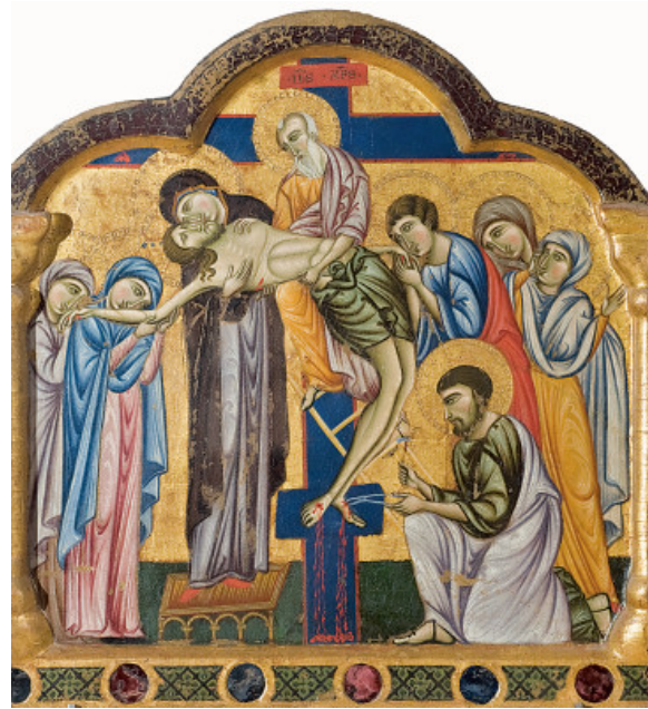
fig. 4 Master of Saint Francis, Deposition , c. 1272, tempera on panel, Galleria Nazionale dell'Umbria.