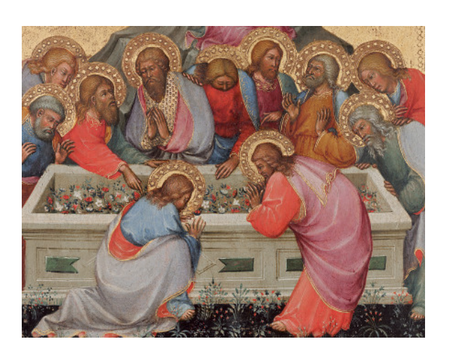
fig. 3 Detail of figures reacting to the miracle of the flowers in place of Mary's body, Paolo di Giovanni Fei, The Assumption of the Virgin with Busts of the Archangel Gabriel and the Virgin of the Annunciation , c. 1400/1405, tempera on panel, National Gallery of Art, Washington, Samuel H. Kress Collection