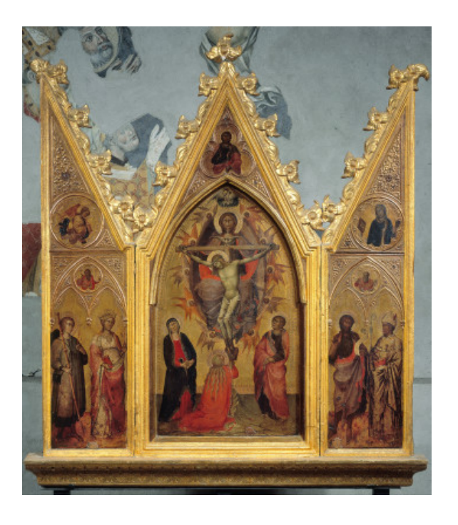
fig. 2 Paolo di Giovanni Fei, Triptych from the Minutolo Chapel, 1407–1408, tempera on panel, Naples Cathedral.