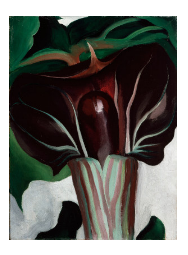
fig. 1 Georgia O'Keeffe, Jack-in-the-Pulpit No. 1, 1930, oil on canvas, private collection, Los Angeles.