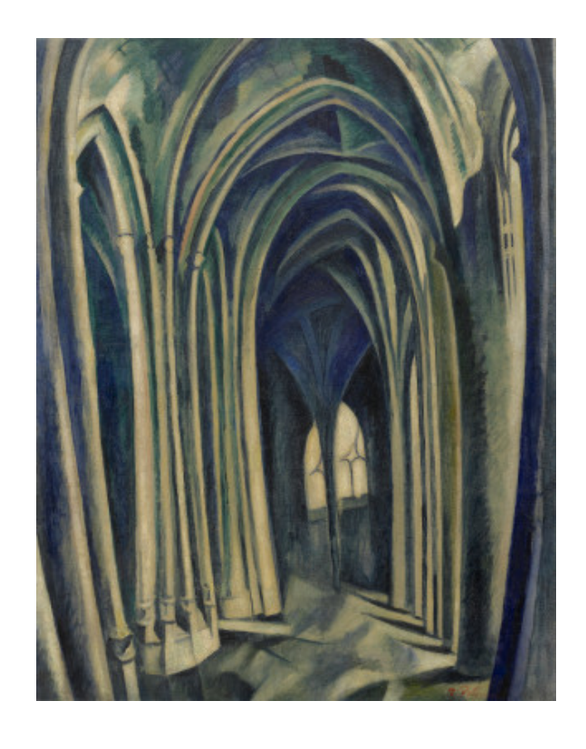
fig. 2 Robert Delaunay, Saint-Severin No. 3, 1909–1910, oil on canvas, The Solomon R. Guggenheim Museum, New York, Founding Collection.