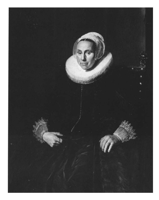
Fig. 2. Frans Hals, Cornelia Claesdr. Voogbt , 1631, oil on panel, Haarlem, Frans Halsmuseum

trimmed, the Frick painting along the bottom and the Washington painting on all four sides.<sup>7</sup> It is possible that the original format of these paintings approached that of the Haarlem ones, which are more vertical in shape.