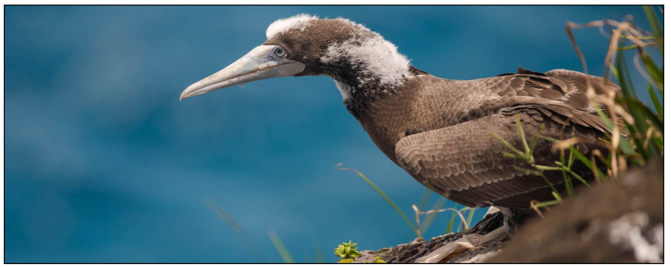
AVIFAUNA OF GAMBIER, FRENCH POLYNESIA

In this context, the use of climate sciences has been minimal, not to say nil. Despite initial knowledge synthesis and vulnerability analysis efforts, the project has operated on the basis of a few very general elements: the ocean temperature will increase and its pH will decrease, sea level will rise, rainfall extremes are likely to worsen and droughts to be more severe and last longer, etc. The project's approach, based on vulnerability, has proven pragmatic to avoid the risk of inaction due to an endless quest for increasingly accurate and reliable data at the local level.