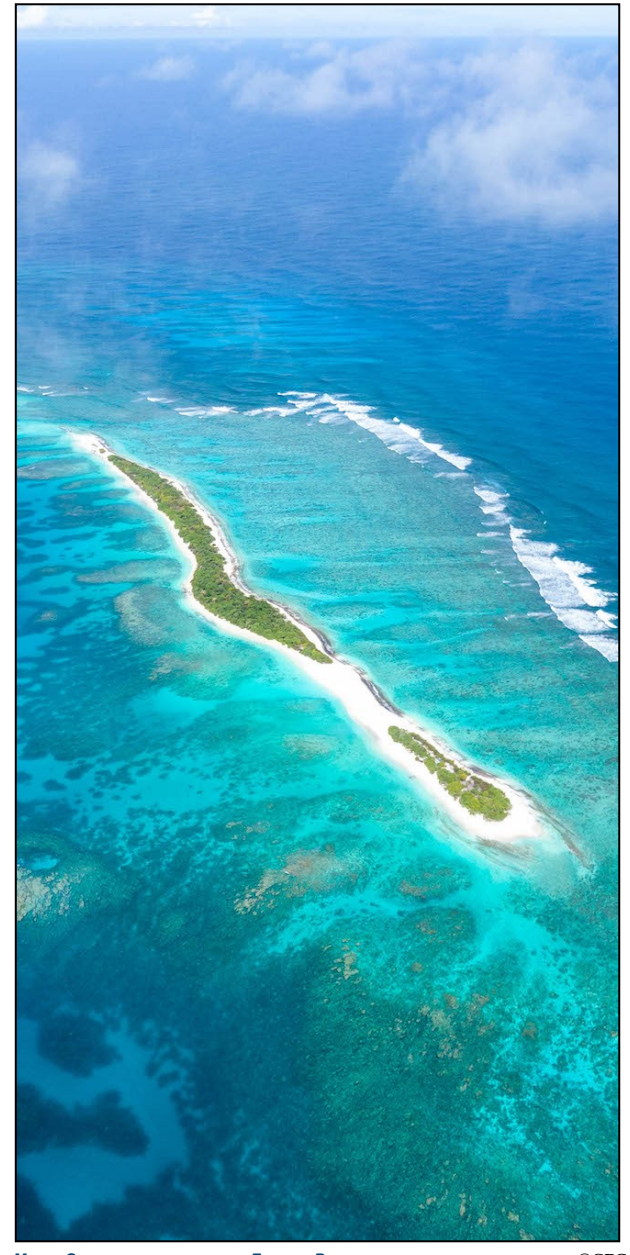
MOTU, GAMBIER ARCHIPELAGO, FRENCH POLYNESIA