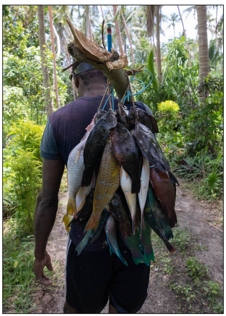
NORTH EFATE, VANUATU

However, beyond the intuition that the activities implemented have reduced the vulnerability of populations of pilot sites to climate change, the use of the tool chosen to measure the reduction of vulnerability<sup>4</sup> (Vulnerability Reduction Assessment, VRA) did not give full satisfaction. Several explanations, not exclusive of each other, are possible: flaws specific to the VRA tool, lack of resources for the operators in charge of implementing it, "fatigue" of the populations concerned in the face of repeated consultations from project design throughout implementation.