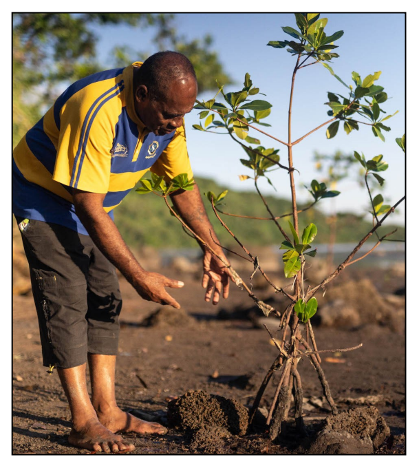
MANGROVES RESTORATION, KADAVU PROVINCE, FIJI

The activities co-constructed with the concerned populations and authorities at the beginning of the project on the seven pilot sites in Fiji, New Caledonia, French Polynesia and Vanuatu, proved to be extremely diverse. Moreover, their link with climate change sometimes seemed tenuous: for example, waste management, the regulation of invasive species or the creation and management of protected areas. Early in the project, an important question arose: was climate change a veneer of modernity applied to activities that were certainly necessary, but at the same time "traditional" in the field of the environment and independent of climate change? Or did the RESCCUE project approach, its logical framework, its tools and activities really make it a climate change adaptation project?