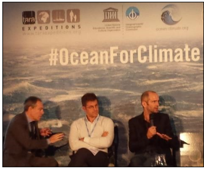
COP 21 (6

This initiative identified a wide range of ocean-based measures to mitigate climate change and its impacts on marine ecosystems, suggesting an important role for the ocean community in both adaptation and mitigation. While several of these measures have high potential to solve the problem globally, they have too many uncertainties and / or risks of negative collateral effects to be recommended for large scale deployment. Conversely, while most local measures appear to be "no-regret", they do not respond to the challenge on a global scale. The "solution" therefore lies in the combination of global and local measures, some of which can already be deployed on a large scale now.