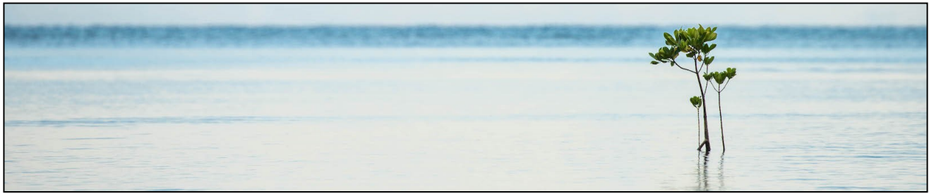
MANGROVE SEEDLING, NEW CALEDONIA

With the aim of contributing to the 6th IPCC report, the Ocean Solutions initiative resulted in the publication of a scientific article in Frontiers in Marine Science. A policy brief and an animated video were also produced.