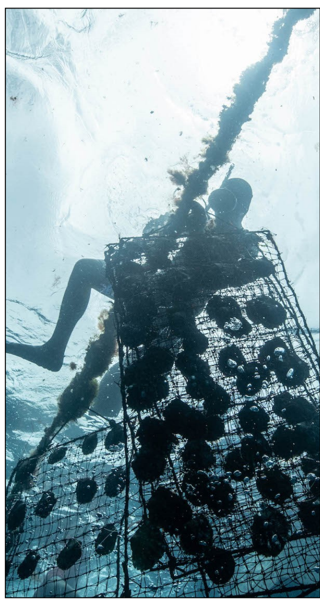
PEARL FARMING. GAMBIER ARCHIPELAGO. FRENCH POLYNESIA

A need to investigate and strengthen the use of climate sciences