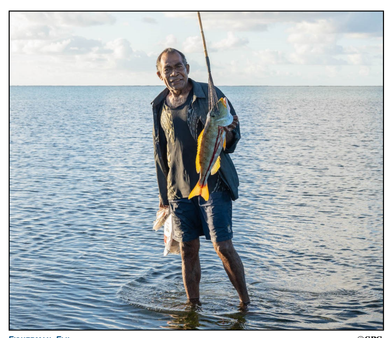
FISHERMAN, FIJI

RESCCUE chose to use a simple, low-cost, readily available and internationally recognized Vulnerability Reduction Assessment<sup>2</sup> (VRA) methodology: "VRA is designed to measure the changing vulnerabilities of communities, and to be vastly comparable across different projects, regions, and contexts, making it possible to determine if a given project is successful or unsuccessful in reducing climate change vulnerability. Based on vulnerability as perceived by concerned populations, it documents a project's contributions to adaptation as well as its contributions to broader vulnerability and enhancing resilience."