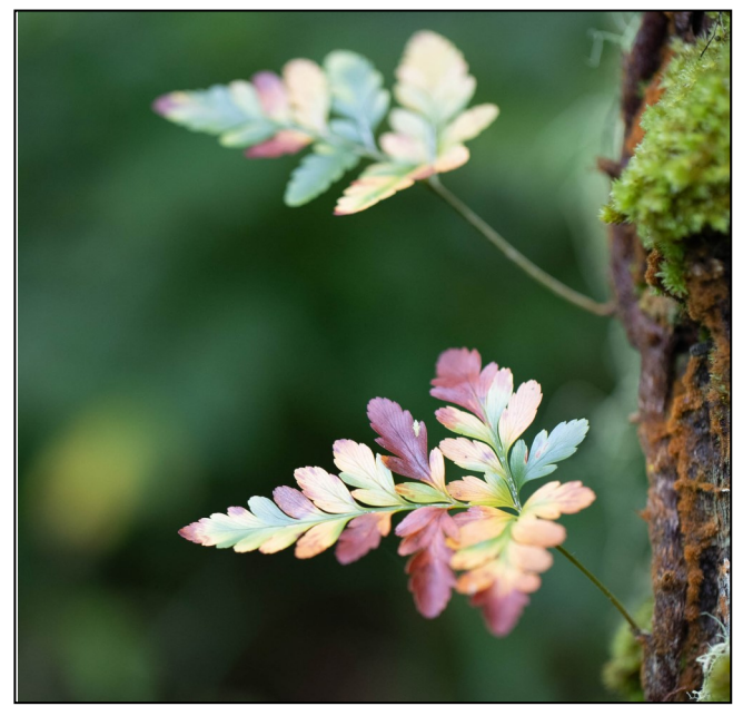
FLORA OF GAMBIER, FRENCH POLYNESIA

What does a 0.3 °C difference in air temperature (between global models and the downscaling) at the end of the century for a given IPCC RCP scenario mean in practice, for which stakeholders facing which decisions? How does a 20% drop in precipitation for a given scenario at the end of the century in the Great South of New Caledonia question project activities - while it is not for example the time horizon of investments to fight against fires?