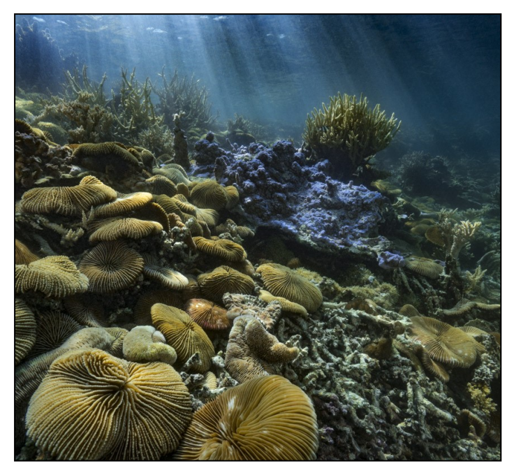
CORAL REEF, FRENCH POLYNESIA