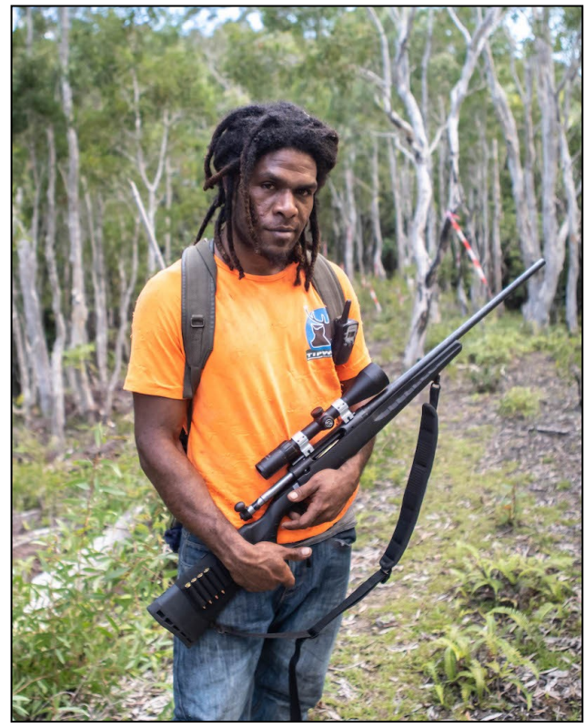
HUNTER FROM THE TIPWOTO ASSICATION, TOUHO, NEW-CALEDONIA

However, the degree to which project activities have been consistent with the definitions of these two concepts has varied widely. For example, the activities of waste management or invasive species regulation, designed with real but somewhat vague climate concerns, have been globally relevant from the point of view of ecosystem-based adaptation and nature-based solutions (EbA-and NbS-relevant). Mangrove replanting or watershed restoration activities on the other hand have been very directly related to these two concepts.