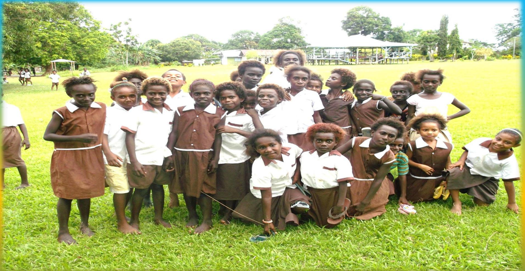
Students of Malasang Elementary School in Autonomous Region Of Bougainville