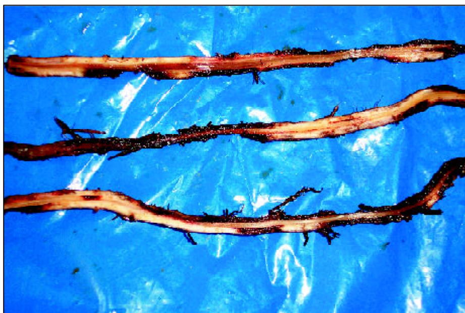
Figure 1: Lesions on banana roots caused by nematodes

Burrowing nematodes feed and reproduce within living corms and roots. They can also be found in the soil. As they burrow into the roots, the tissues behind their advance become necrotic and this is helped by the invasion of other rot-causing organisms. Eggs are laid in the corms and roots. Approximately two weeks are required for the life cycle to be completed. Female nematodes live two or three months and lay more than 100