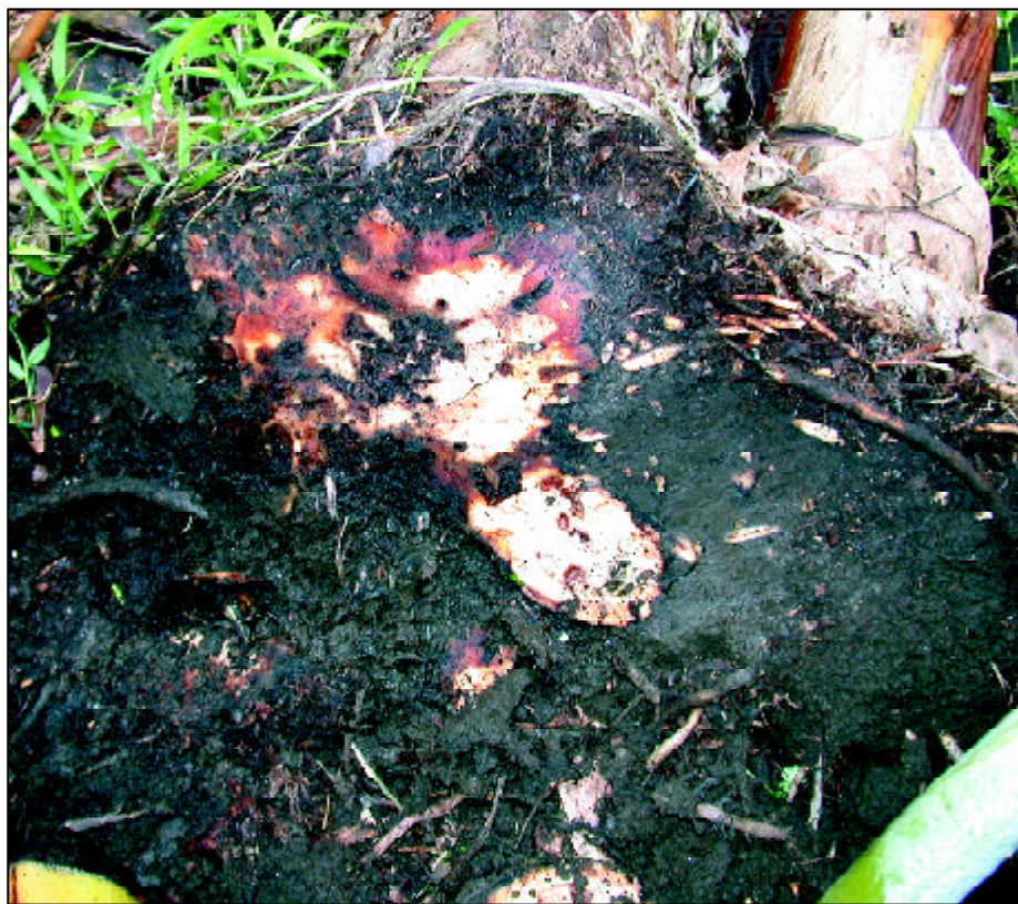
Figure 2: Advanced rotting leading to toppling disease caused by nematodes.

Vydate is systemic and like most nematicides it is highly toxic and should be administered only by trained persons and according to instructions and precautionary measures as specified on the label. Because it is used undiluted in the control of banana nematodes it should be administered at all times using a specially designed