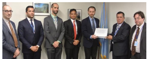
Figure 2 Representatives from RMI depositing their maritime boundaries with the UN in New York