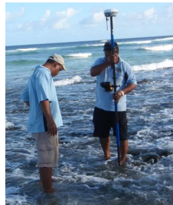
Figure 3 Surveying basepoints in Kiribati.

At the Pacific Islands Forum leaders' meeting in September 2019, leaders acknowledged "the urgency and importance of securing the region's maritime boundaries as a key issue for the development and security of our region, and thereby for the security and well-being of the Blue Pacific Continent."