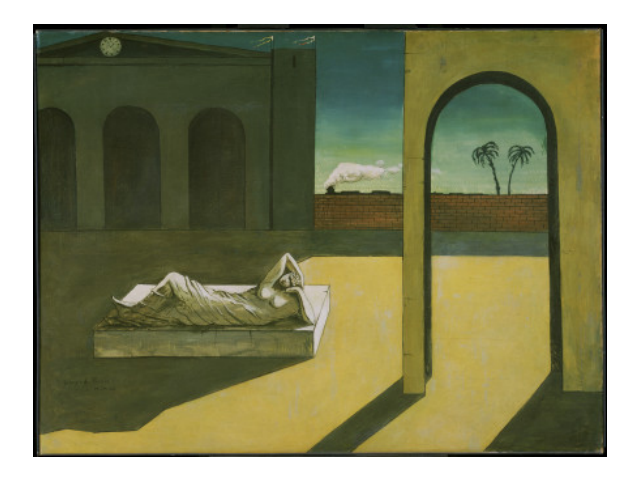
fig. 8 Giorgio de Chirico, The Soothsayer's Recompense , 1913, oil on canvas, Philadelphia Museum of Art, The Louise and Walter Arensberg Collection.