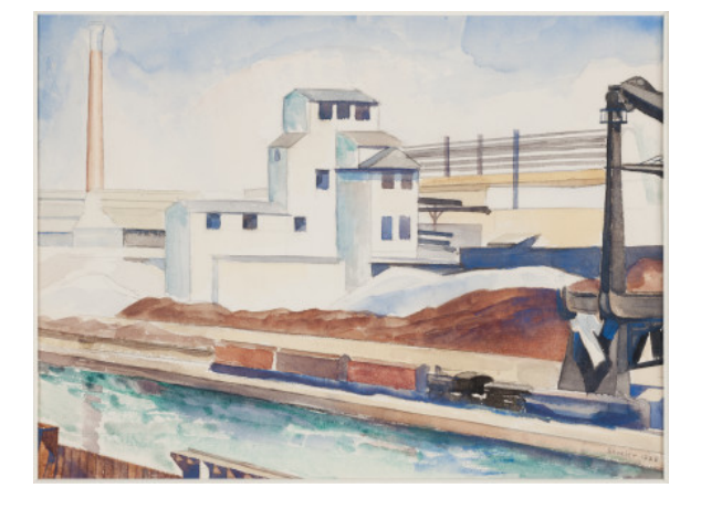
fig. 1 Charles Sheeler, River Rouge Industrial Plant , 1928, graphite and watercolor, Carnegie Musem of Art, Pittsburgh, Gift of G. David Thompson.