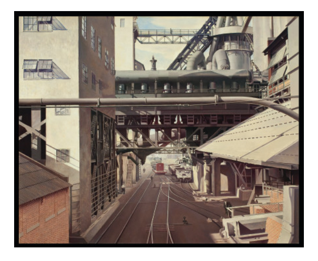
fig. 6 Charles Sheeler, City Interior, 1936, aqueous adhesive and oil on composition board (Masonite), Worcester Art Museum, Elizabeth M. Sawyer Fund in Memory of Jonathan and Elizabeth M. Sawyer.

fig. 5 Charles Sheeler, River Rouge Plant , 1932, oil and pencil on canvas, Whitney Museum of American Art, New York, Purchase 32.43