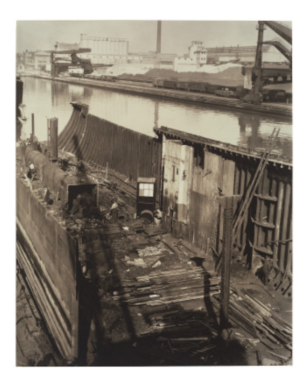
fig. 2 Charles Sheeler, Salvage Ship-Ford Plant , 1927, gelatin silver print, Museum of Fine Arts, Boston.

fig. 1 Charles Sheeler, River Rouge Industrial Plant , 1928, graphite and watercolor, Carnegie Musem of Art, Pittsburgh, Gift of G. David Thompson.