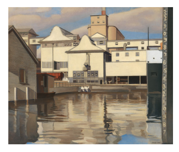
fig. 4 Charles Sheeler, American Landscape , 1930, oil on canvas, The Museum of Modern Art, New York, Gift of Abby Aldrich Rockefeller.

fig. 5 Charles Sheeler, River Rouge Plant , 1932, oil and pencil on canvas, Whitney Museum of American Art, New York, Purchase 32.43