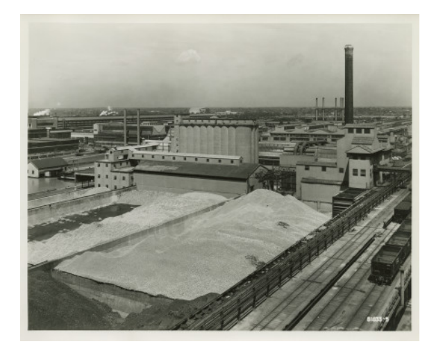
fig. 7 Charles Sheeler, Ford Rouge Cement Plant , 1945, photograph