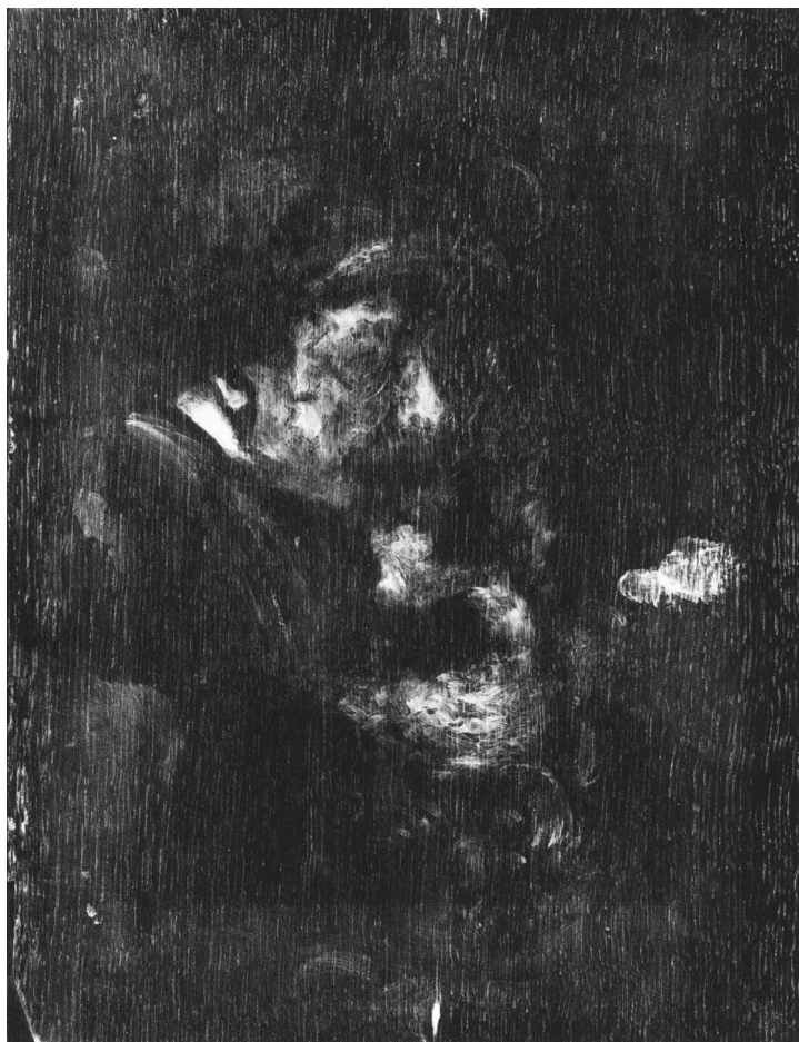
Fig. 1. X-radiograph of 1942.9.63, here shown upside down