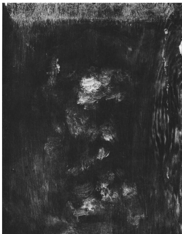
Fig. 2. X-radiograph of 1942.9.58

the head lacks the firm modeling so typical of Rembrandt's works.