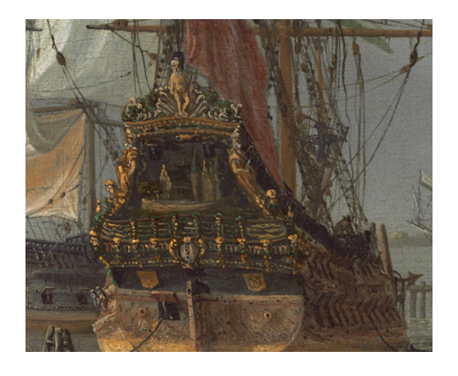
fig. 3 Detail, the stern of warship Huis te Swieten, Reinier Nooms, called Zeeman, Amsterdam Harbor Scene, c. 1658, oil on canvas, National Gallery of Art, Washington, The Lee and Juliet Folger Fund, 2011.3.1