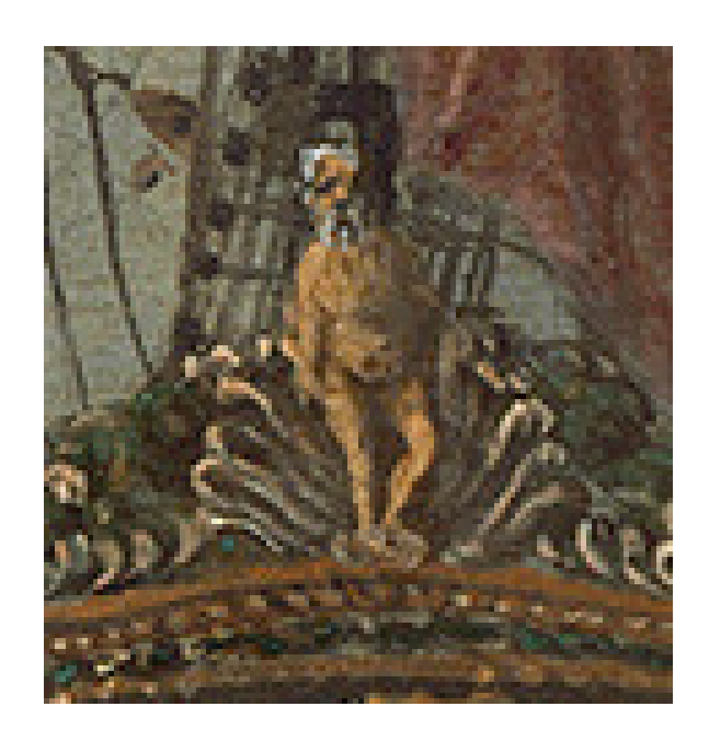
fig. 6 Detail, the carved figure on the stern of the Huis te Swieten, Reinier Nooms, called Zeeman, Amsterdam Harbor Scene , c. 1658, oil on canvas, National Gallery of Art, Washington, The Lee and Juliet Folger Fund, 2011.3.1