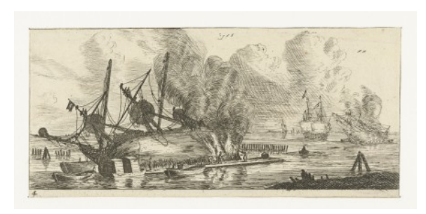
fig. 2 Reinier Nooms, Two Ships Careened for Caulking the Hulls, engraving from Diverse inschepingen en dergelijken (Amsterdam, 1651–1652), fol. 4, Rijksmuseum, Amsterdam, inv. RP-P-OB-20.588