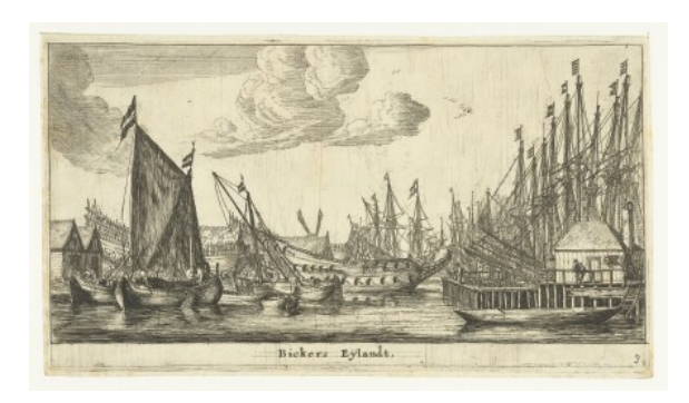
fig. 8 Reinier Nooms, Bicker's Eylandt engraving from Verscheyde Schepen en Gesichten van Amstelredam , Amsterdam, 1654, Rijksmuseum, Amsterdam, inv. RP-P-OB-20.527