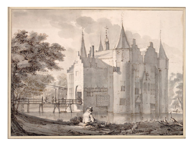
fig. 4 Roelant Roghman, Schloss Swieten, 1646–1647, pen in brown and brush in gray, Graphische Sammlung Albertina, Vienna, inv. 15130