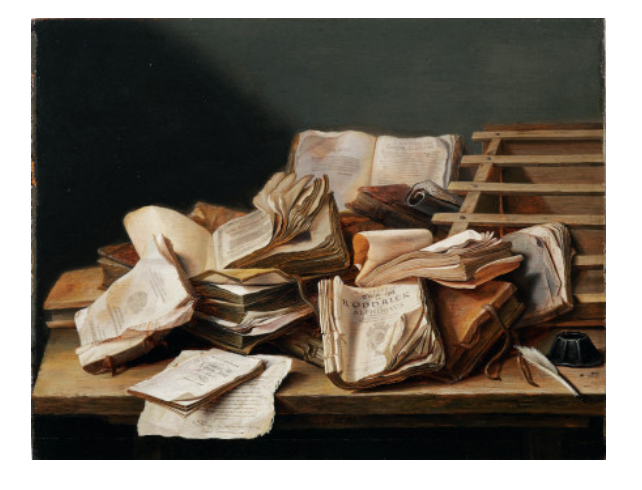
fig. 3 Jan Davidsz. de Heem, Still Life with Books , 1628, oil on panel, Fondation Custodia, Collection Frits Lugt, Acquired in 1918, inv. 183