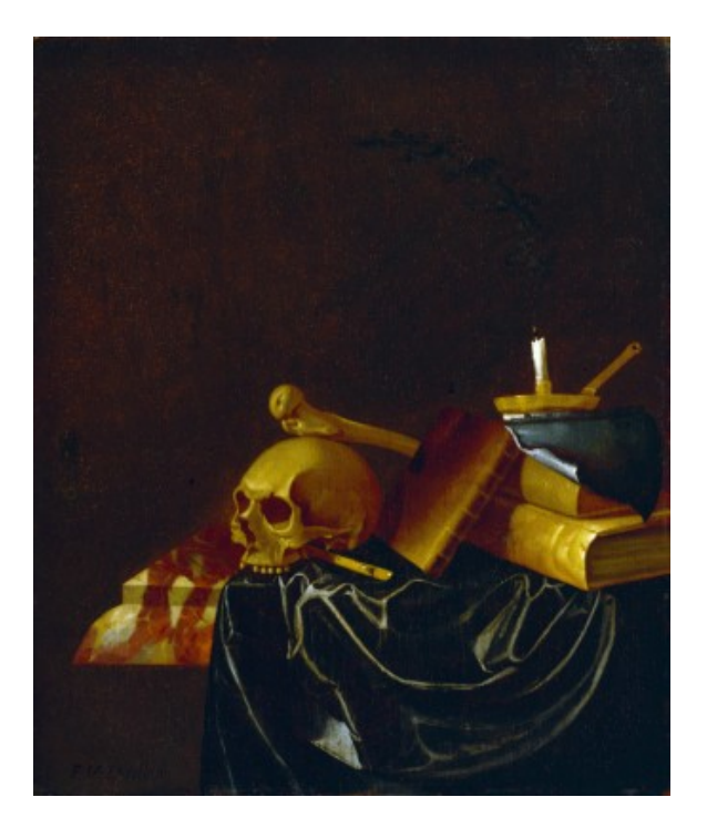
fig. 1 François van Daellen, Vanitas Still Lif e, 1692, oil on oak panel, Detroit Institute of Arts, Gift of Alfred Brod, Ltd.