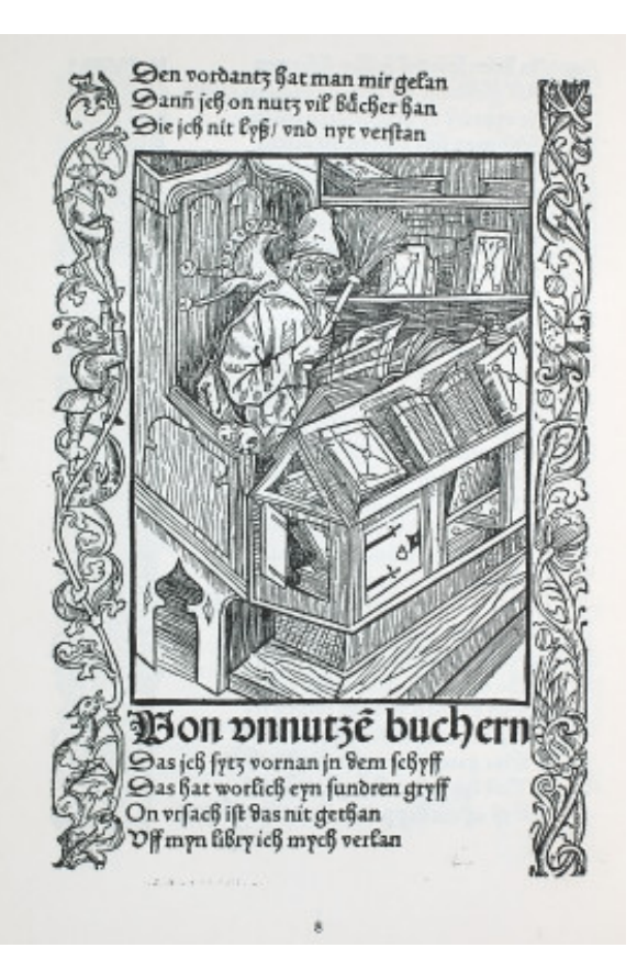
fig. 4 Sebastian Brant, Das Narrenschiff: Faksimile der Erstausgabe von 1494 / Sebastian Brant; Mit einem Anhang enthaltend die Holzschnitte der folgenden Originalausgaben und solche der Locherschen Übersetzung, und einem Nachwort von Franz Schultz, Basel, 1494, National Gallery of Art Library, Washington, PT1509. N2 1913