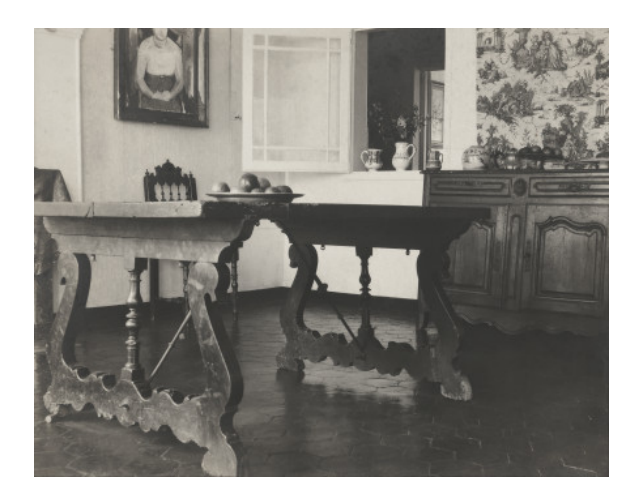
fig. 1 Photo of Patrick Henry Bruce's Paris apartment, c. 1917–1918.