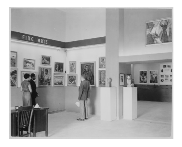
fig. 3 Texas Centennial Exhibit, Hall of Negro Life , 1936, photograph