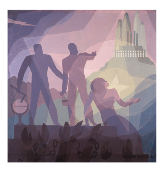
fig. 2 Aaron Douglas, Aspiration , 1936, oil on canvas, The Fine Arts Museums of San Francisco