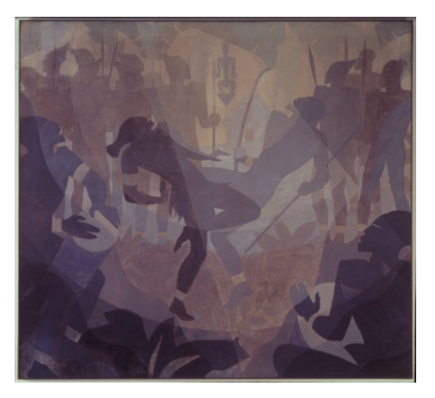
fig. 4 Aaron Douglas, Aspects of Negro Life: The Negro in an African Setting , 1934, oil on canvas, The New York Public Library, Schomburg Center for Research in Black Culture, Art and Artifacts Division.