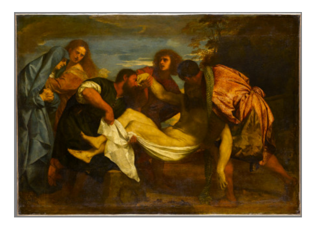
fig. 8 Titian, The Entombment of Christ, c. 1520, oil on canvas, Musée du Louvre, Paris.