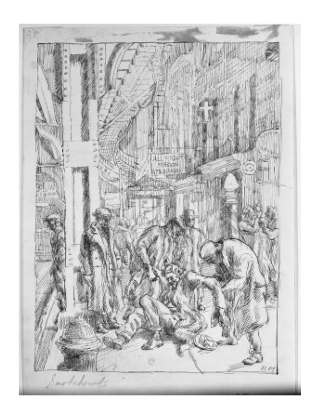
fig. 6 Reginald Marsh, Study for Smokehounds , 1934, black ink over graphite on off-white wove paper, Harvard Art Museums / Fogg Museum, Gift of Mrs. Reginald Marsh. © Estate of Reginald Marsh / Art Students League, New York / Artists Rights Society (ARS), New York.