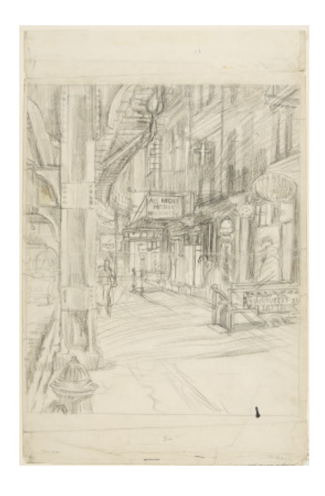
fig. 2 Reginald Marsh, Study for Smokehounds, c. 1934, graphite and black chalk on off-white wove paper, Harvard Art Museums/Fogg Museum, Gift of Mrs. Reginald Marsh, 1962.273. © Estate of Reginald Marsh / Art Students League, New York / Artists Rights Society (ARS), New York. © President and Fellows of Harvard College