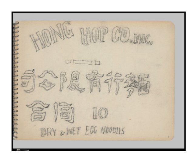
fig. 4 Reginald Marsh, page from sketchbook no. 59, 11854, black chalk on paper, The Metropolitan Museum of Art, New York. © 2017 Estate of Reginald Marsh / Art Students League, New York / Artists Rights Society (ARS), New York.