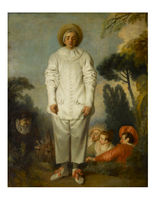
fig. 2 Jean-Antoine Watteau, Pierrot, formerly known as Gilles , c. 1718–1719, oil on canvas, Musée du Louvre, Paris.