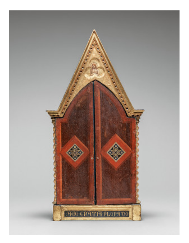
fig. 1 Exterior view of portable triptych with wings closed, tempera on panel, National Gallery of Art, Washington, Samuel H. Kress Collection