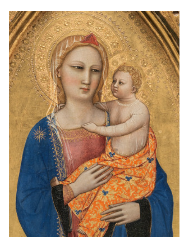
fig. 2 Detail of Mary, Nardo di Cione, Madonna and Child, with Saints Peter and John the Evangelist, and Man of Sorrows , c. 1360, tempera on panel, National Gallery of Art, Washington, Samuel H. Kress Collection

fig. 1 Exterior view of portable triptych with wings closed, tempera on panel, National Gallery of Art, Washington, Samuel H. Kress Collection