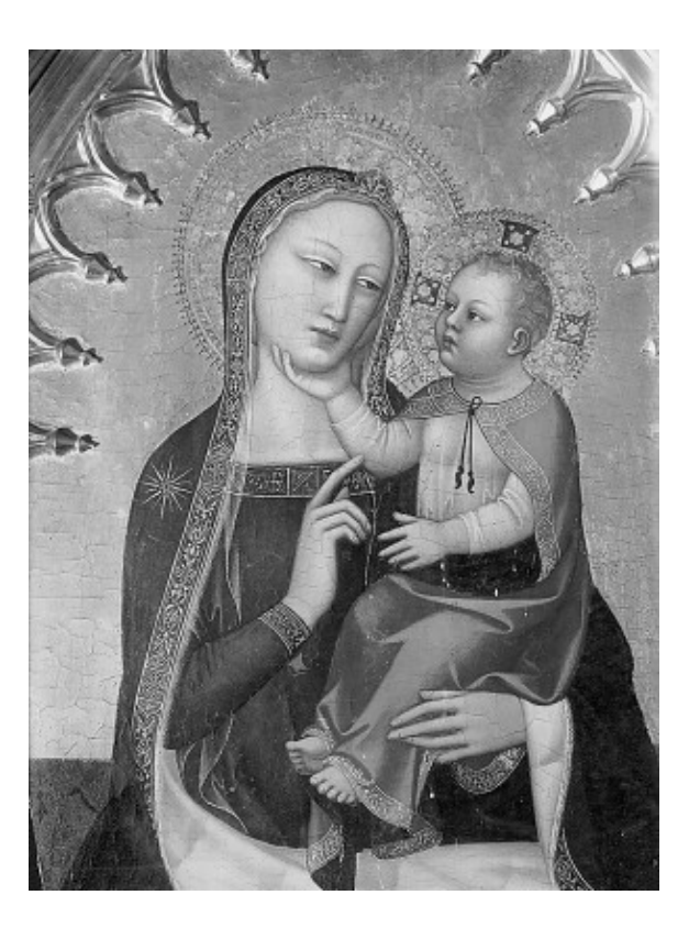
fig. 4 Nardo di Cione, Madonna and Child , tempera on panel, Bojnice Castle, Slovakia