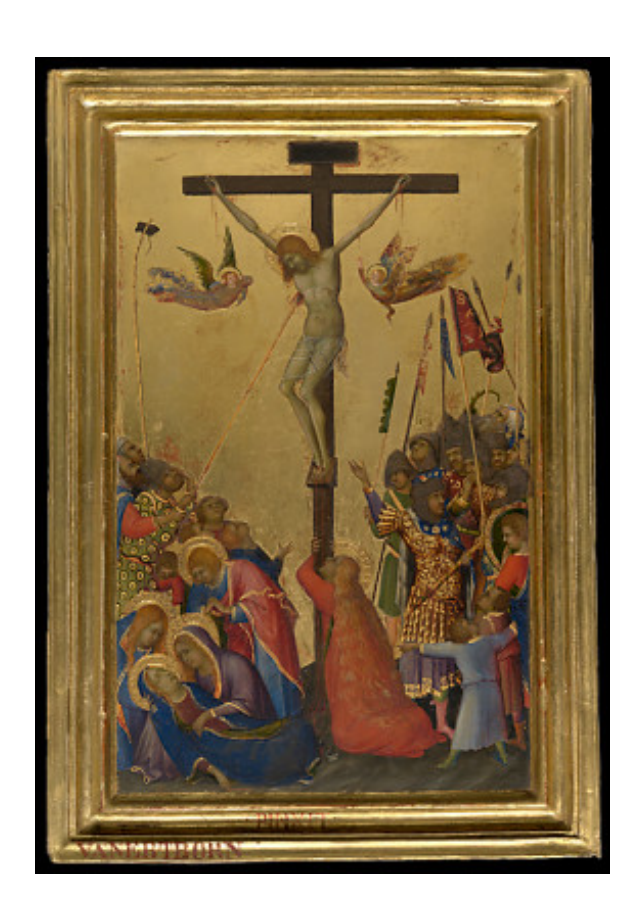
fig. 1 Simone Martini, Crucifixion (from the Orsini Polyptych), c. 1335, tempera on panel, Royal Museum of Fine Arts, Antwerp