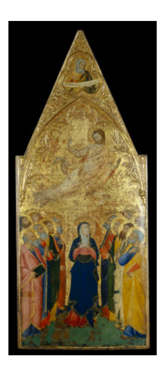
fig. 3 Andrea di Vanni, Ascension, c. 1380s, tempera on panel, The State Hermitage Museum, St. Petersburg, Gift of the heirs of Count G. S. Stroganov, 1911

Italian Thirteenth and Fourteenth Century Paintings