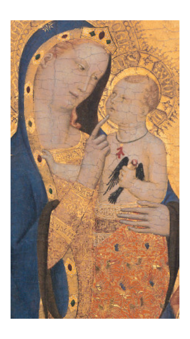
fig. 1 Detail of Madonna and Child (central panel), Puccio di Simone and Allegretto Nuzi, Madonna and Child Enthroned with Saints and Angels , 1354, tempera on panel, National Gallery of Art, Washington, Andrew W. Mellon Collection