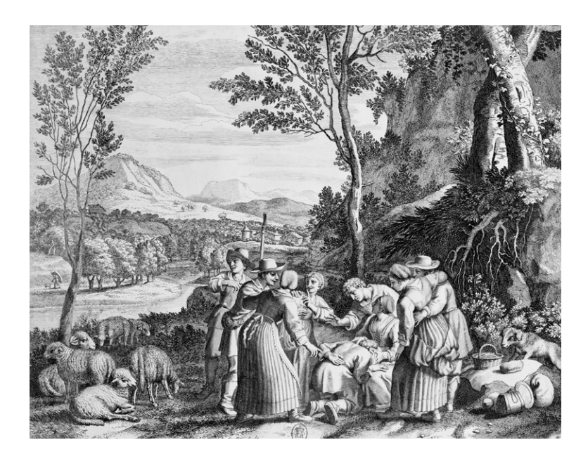
Fig. 2. Claudine Bouzonnet-Stella after Jacques Stella, Hot Cockles (La Main Chaude) , 1657, engraving, Paris, Bibliothèque nationale de France