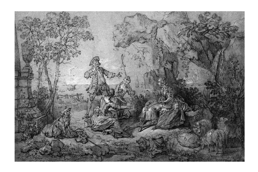
Fig. 3. Jean Baptiste Oudry, Hot Cockles (La Main Chaude) , 1728, black and white chalk, Stockholm, Nationalmuseum