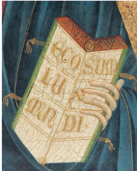
fig. 4 Detail, Grifo di Tancredi, Christ Blessing , c. 1310, tempera on poplar, National Gallery of Art, Washington, Andrew W. Mellon Collection