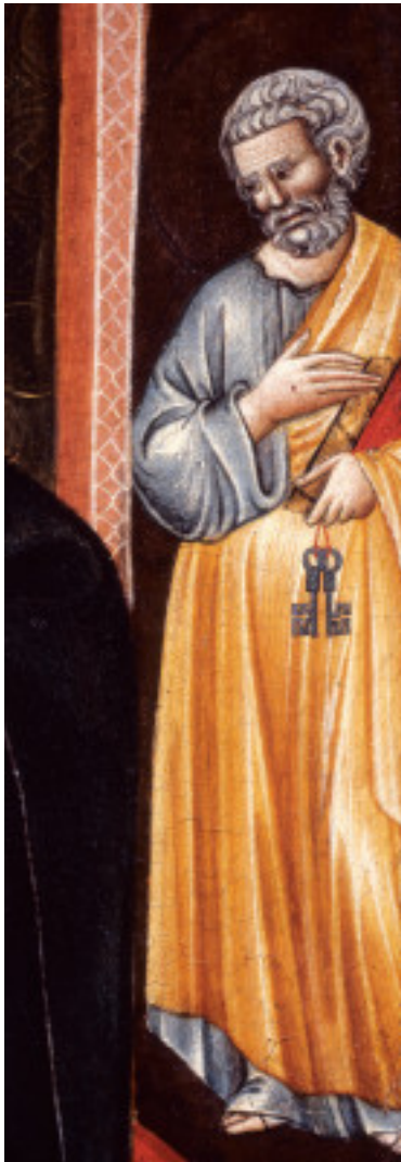
fig. 3 Detail of Saint Peter, Grifo di Tancredi, San Gaggio altarpiece, c. 1300, tempera on panel, Galleria dell'Accademia, Florence