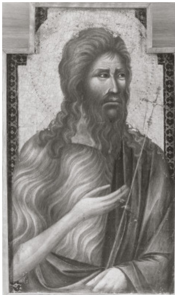
fig. 2 Grifo di Tancredi, Saint John the Baptist , c. 1310, tempera on panel, Musée des Beaux-Arts, Chambéry