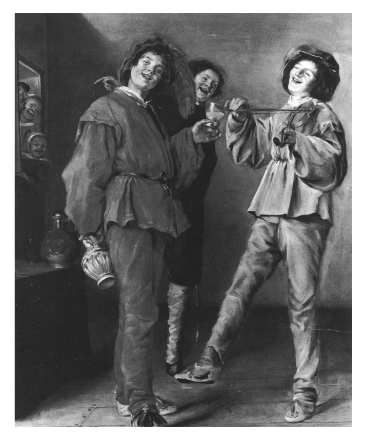
Fig. 2. Judith Leyster, Merry Company , 1629/1631, oil on canvas, The Netherlands, private collection

hypothesis is probably not correct. First, the costume cannot date that late. This flat, lace-edged style of collar can be found in portraits from the late 1620s but not in the 1630s.<sup>7</sup> The style of the cap, moreover, is extremely close to one in Leyster's Carousing Couple (1630, Louvre, Paris, inv. no. R.F. 2131). The smooth modeling of the heads of the women in these two paintings is also extremely close. Their features are somewhat superficially rendered in comparison to the more three-dimensionally conceived genre figures that Leyster painted in the early to mid-1630s.8 Finally, the painting of a violin player displayed on the easel in the Self-Portrait derives from a Merry Company that she executed between about 1629 and 1631 (fig. 2). It seems unlikely that she would have returned to this subject in 1633 to demonstrate her abilities for admission to the guild. All of this evidence suggests a date of about 1630 for this work, when Leyster was about twentyone years old.