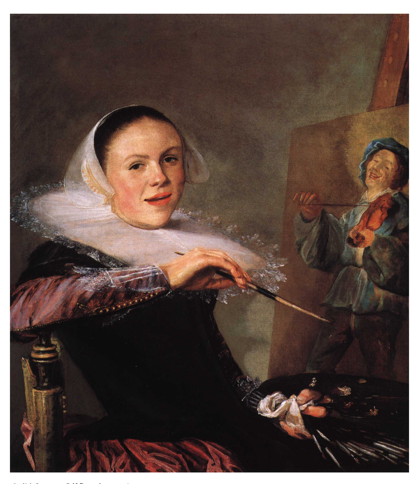
Judith Leyster, Self-Portrait, 1949.6.1