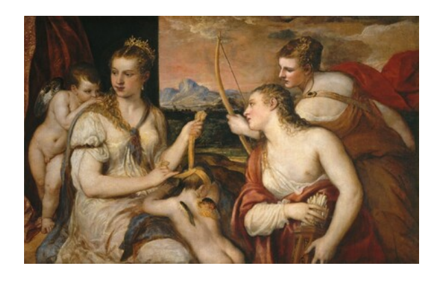
fig. 1 Titian, Venus Blindfolding Cupid, c. 1565, oil on canvas, Galleria Borghese, Rome.

Italian Paintings of the Sixteenth Century