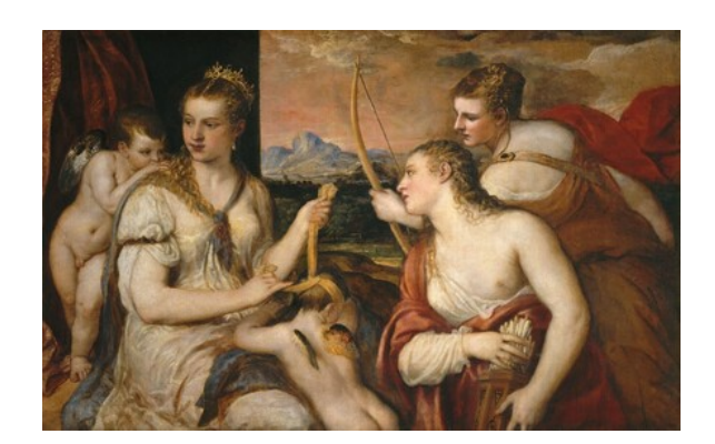
fig. 2 Titian, Venus Blindfolding Cupid , c. 1565, oil on canvas, Galleria Borghese, Rome.