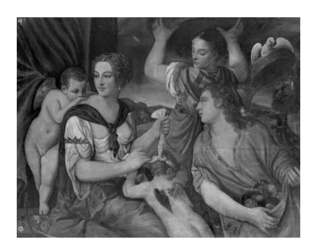
fig. 3 After Titian, Venus Blindfolding Cupid, possibly 18th century, oil on canvas, Kunsthistorisches Museum, Vienna.