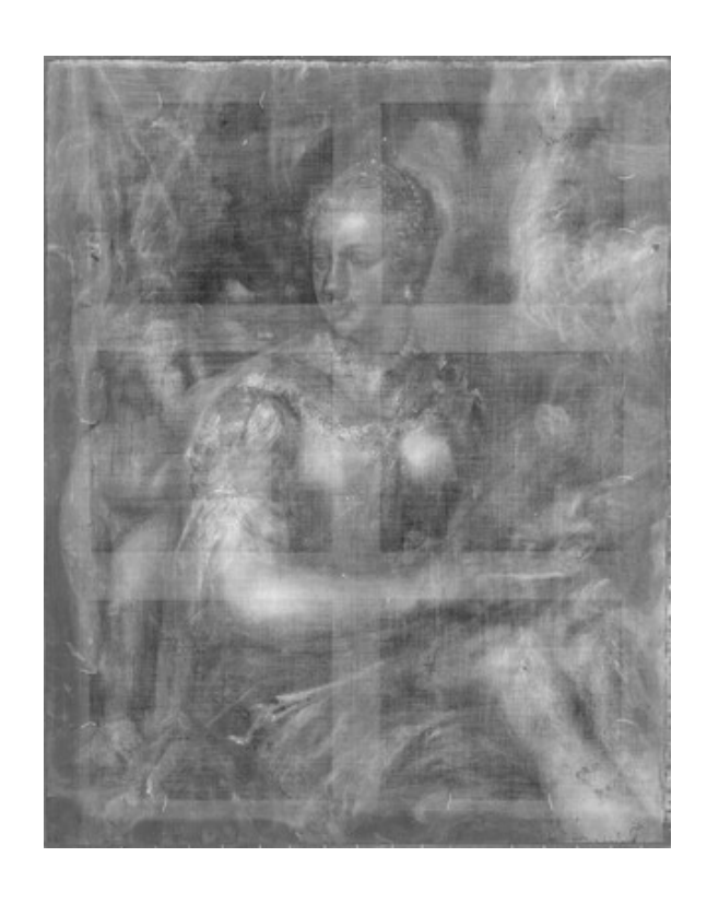
fig. 2 X-radiograph, Workshop or Follower of Titian, Venus Blindfolding Cupid, c. 1566/1570 or c. 1576/1580, oil on canvas, National Gallery of Art, Washington, Samuel H. Kress Collection