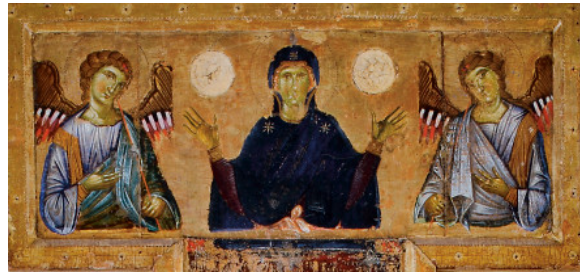
fig. 4 Detail of upper terminal, Master of the Franciscan Crucifixes, Painted Crucifix with the Madonna between Two Angels , c. 1270/1275, tempera on panel, Pinacoteca Nazionale di Bologna