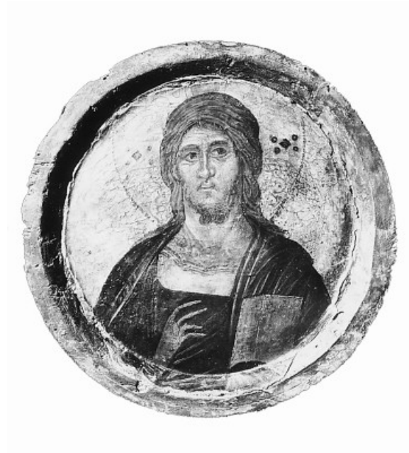
fig. 2 Master of the Franciscan Crucifixes, Bust of the Blessing Christ , c. 1270/1275, tempera on panel, now lost