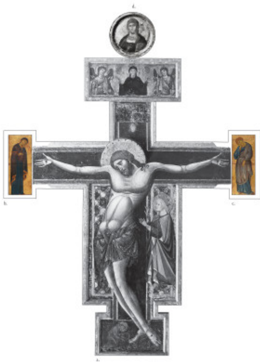
fig. 1 Reconstruction of a painted crucifix, formerly in San Francesco, Bologna, by the Master of the Franciscan Crucifixes (color images are NGA objects): a. Painted Crucifix with the Madonna between Two Angels (above) and the Kneeling Saint Francis (below), and Saint Helen (added by Jacopo di Paolo) (fig. 3); b. The Mourning Madonna ; c. The Mourning Saint John the Evangelist ; d. Bust of the Blessing Christ (fig. 2)