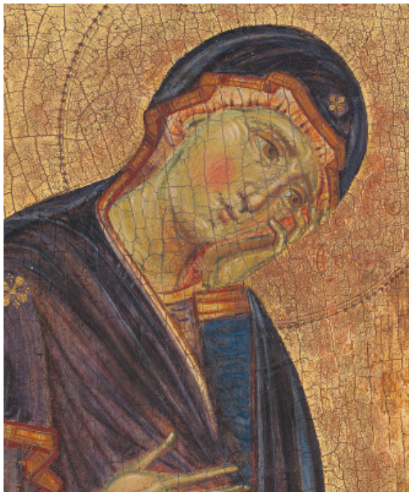
fig. 5 Detail, Master of the Franciscan Crucifixes, The Mourning Madonna , 1270/1275, tempera on panel, National Gallery of Art, Washington, Samuel H. Kress Collection