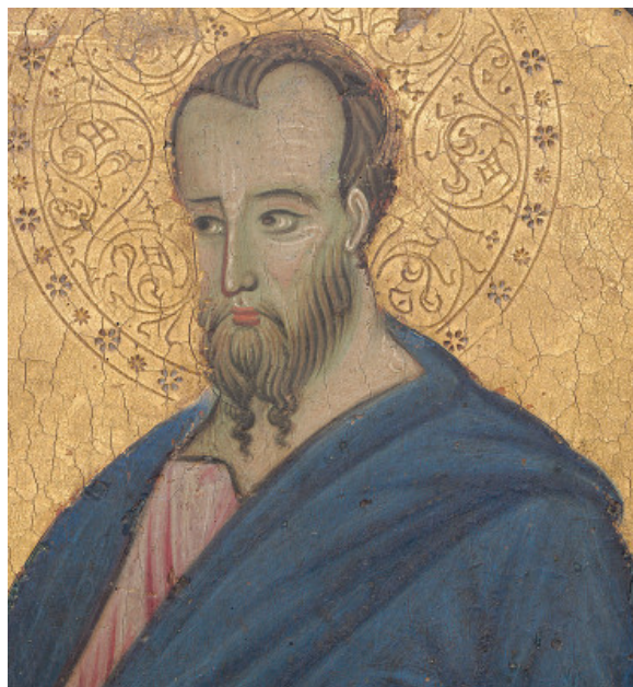
fig. 11 Detail, Master of Saint Francis, Saint James Minor , c. 1272, tempera on panel, National Gallery of Art, Washington, Samuel H. Kress Collection