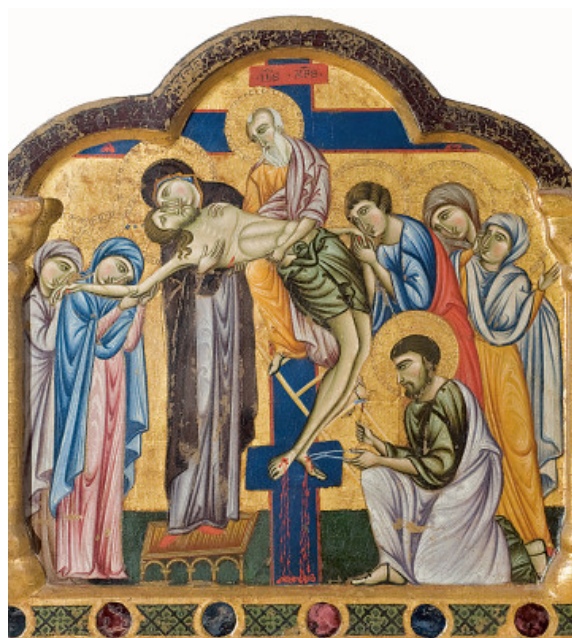
fig. 4 Master of Saint Francis, Deposition , c. 1272, tempera on panel, Galleria Nazionale dell'Umbria.