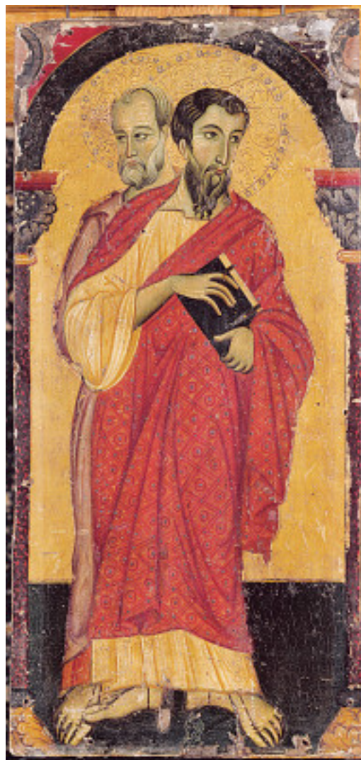
fig. 8 Master of Saint Francis, Saints Bartholomew and Simon , c. 1272, tempera on panel, The Metropolitan Museum of Art, New York, Robert Lehman Collection