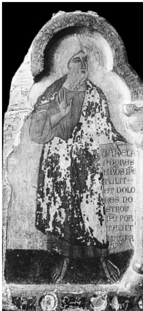
fig. 3 Master of Saint Francis, Prophet Isaiah , c. 1272, tempera on panel, Museo del Tesoro della Basilica di San Francesco, Assisi