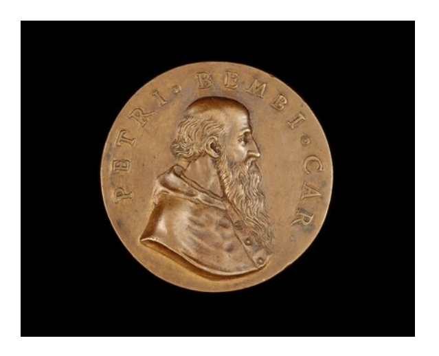
fig. 2 Italian 16th Century (Attributed to Benvenuto Cellini), Pietro Bembo, 1470–1547, Cardinal 1538, Venetian Philologist, Poet and Belletrist [obverse], 1537/1547, bronze, National Gallery of Art, Washington, Samuel H. Kress Collection