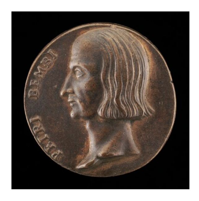
fig. 1 Valerio Belli, Pietro Bembo, 1470–1547, Cardinal 1538 [obverse] , probably 1532, bronze, National Gallery of Art, Washington, Samuel H. Kress Collection