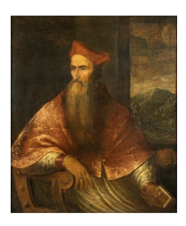
fig. 3 Titian, Portrait of Cardinal Pietro Bembo (1470–1547) , 1545, oil on canvas, Museo Nazionale di Capodimonte, Naples.