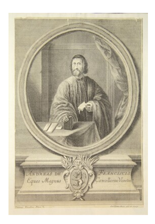
fig. 3 Crescenzio Ricci, after Titian, Portrait of Andrea de' Franceschi , 18th century, engraving, Museo Correr.