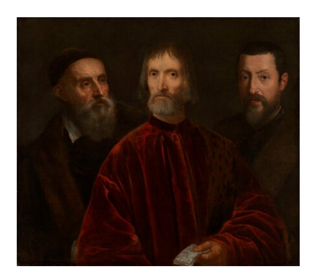
fig. 2 After Titian, Titian and His Friends, c. 1550/1560, oil on canvas