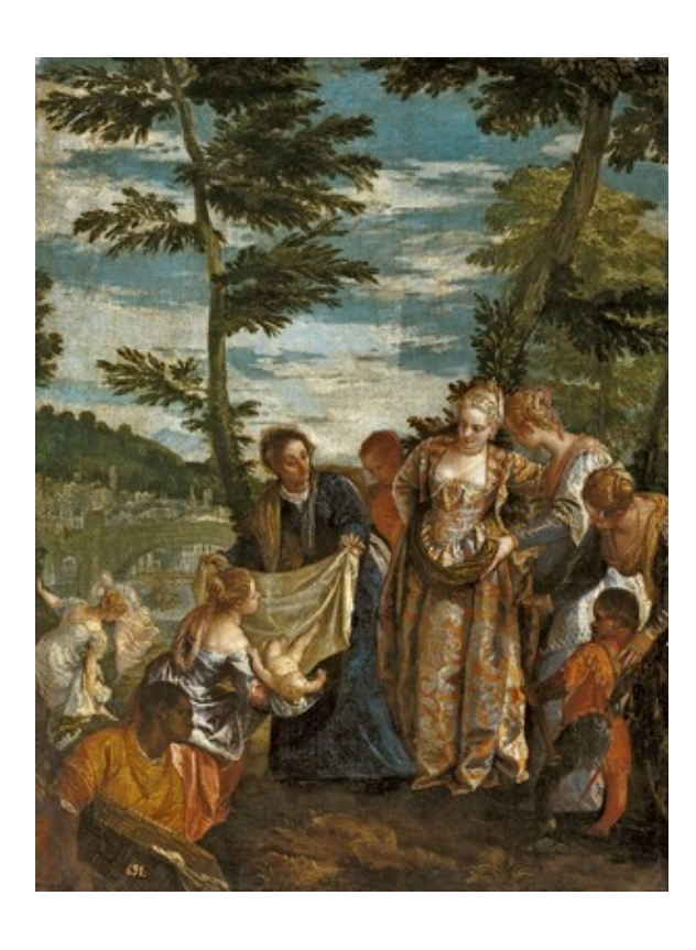
fig. 1 Veronese, The Finding of Moses, c. 1580, oil on canvas, Museo Nacional del Prado.