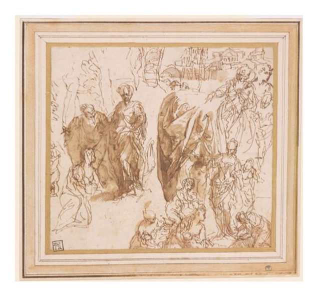
fig. 3 Veronese, Studies for the Finding of Moses , 1581, pen and brown ink, brown wash, on paper, The Morgan Library and Museum, IV, 81, Purchased by Pierpont Morgan (1837–1913) in 1909. The Pierpont Morgan Library, New York