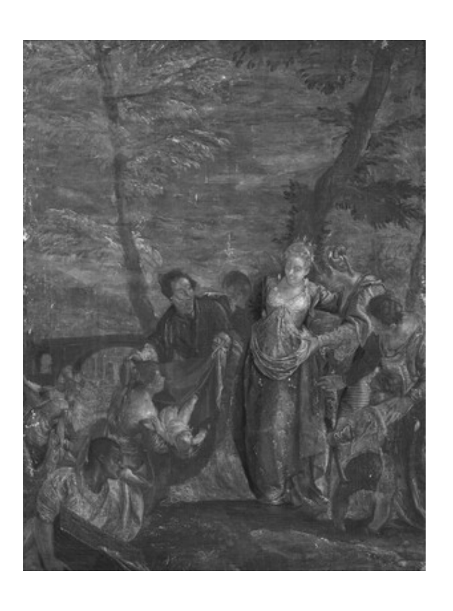
fig. 2 Infrared reflectogram, Veronese, The Finding of Moses , c. 1581/1582, oil on canvas, National Gallery of Art, Washington, Andrew W. Mellon Collection