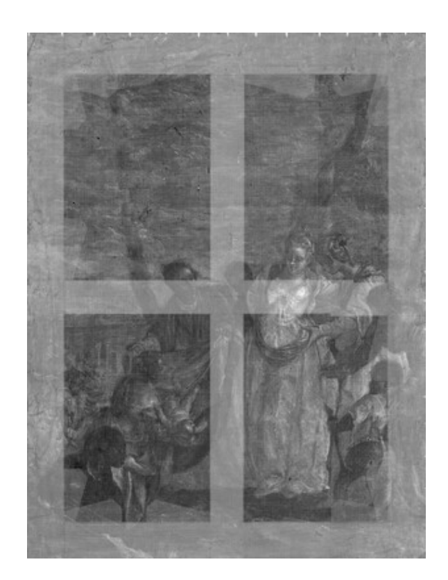
fig. 5 X-radiograph, Veronese, The Finding of Moses , c. 1581/1582, oil on canvas, National Gallery of Art, Washington, Andrew W. Mellon Collection