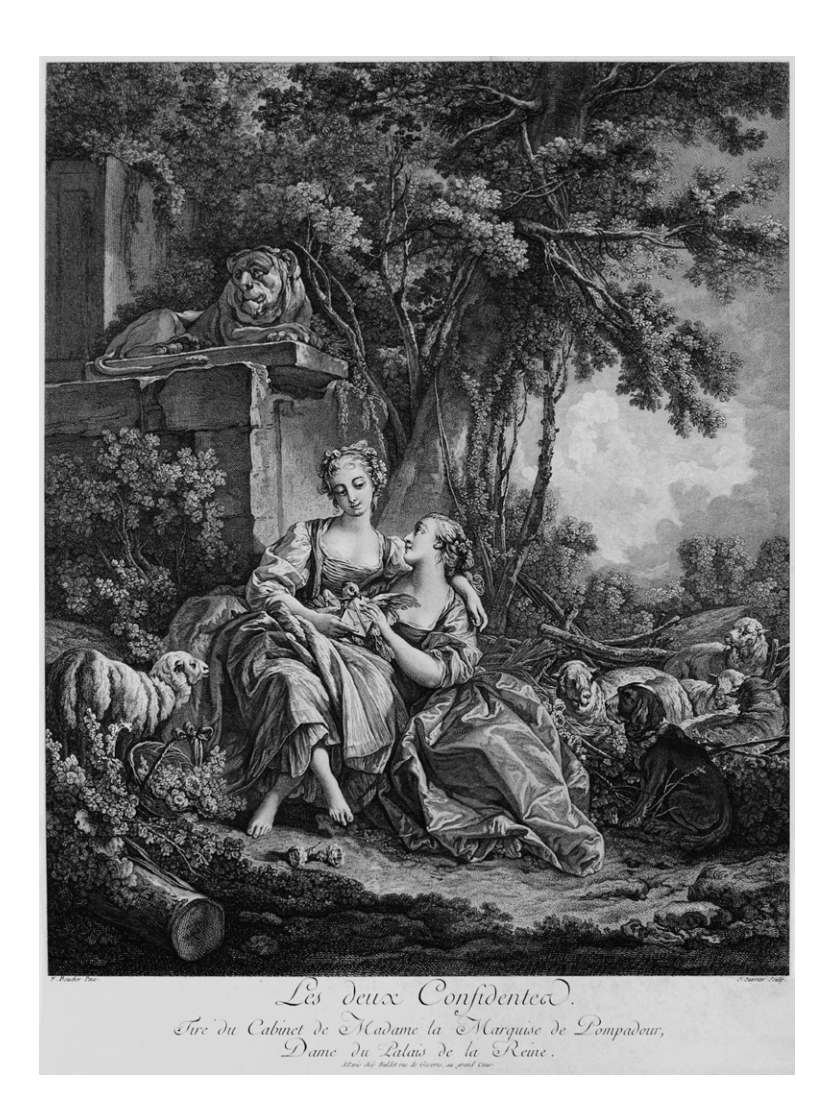
Fig. 3. Jean Ouvrier after François Boucher, The Two Confidantes (Les Deux Confidentes), 1761, engraving and etching, Paris, Musée du Louvre, Rothschild Collection