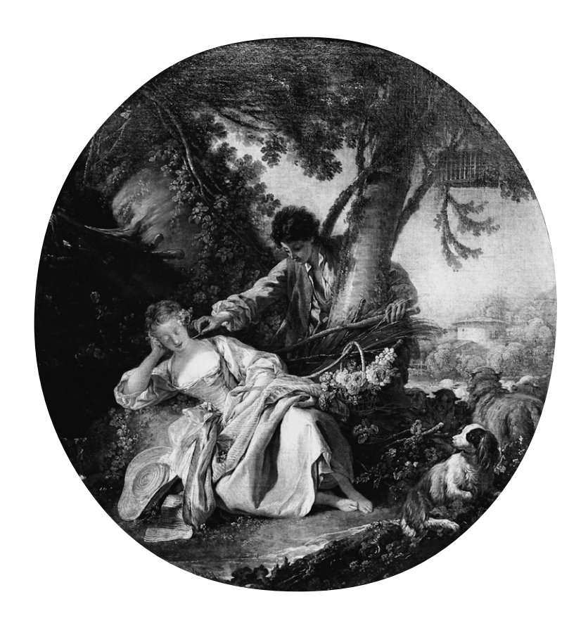
Fig. 1. François Boucher, The Interrupted Sleep, 1750, oil on canvas, New York, The Metropolitan Museum of Art, The Jules Bache Collection, 1949

Although d'Argenville's account of the paintings is vague (even if he took care to relate the details of the room's decoration), we can be confident that they are the canvases now in Washington and New York based on descriptions made when they were exhibited in Paris and on measurements recorded later.<sup>12</sup> As their dates indicate, the pictures were produced in 1750, but their inclusion at the Salon of 1753 presupposes that they were not installed at Bellevue until sometime after the exhibition closed. While the château was dedicated in November 1750, work on the interior continued until 1754.13 Examination of the surfaces of the canvases suggests that the compositions were framed as ovals in boiseries. 14 In any event, the paintings