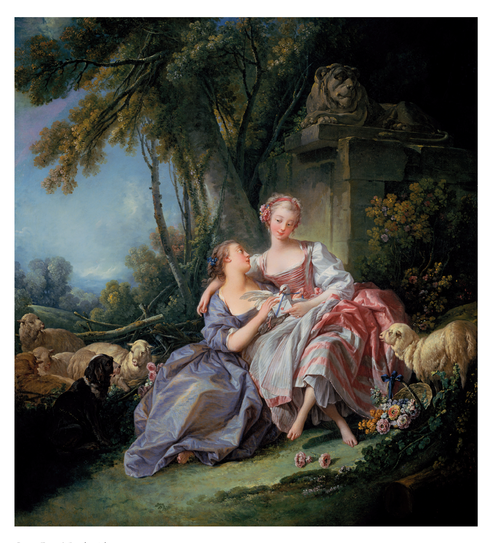
Cat. 2. François Boucher, The Love Letter