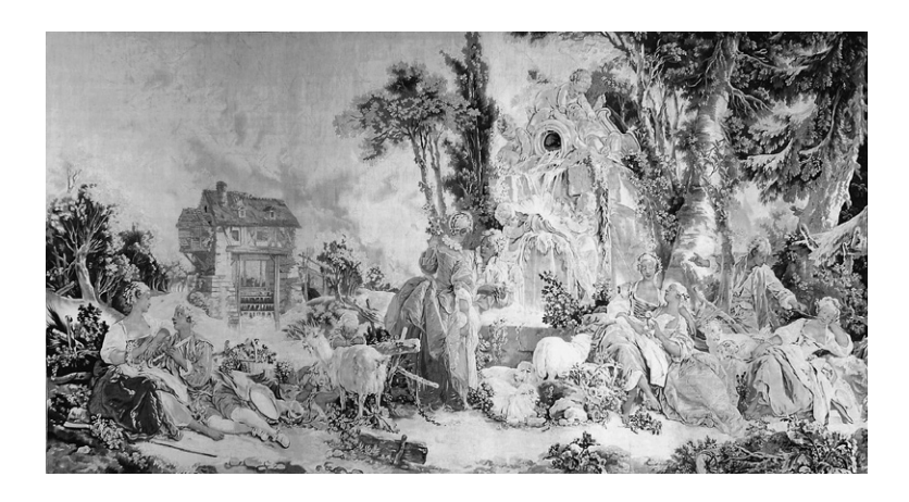
Fig. 2. After François Boucher, The Fountain of Love, 1755, tapestry, San Marino, California, The Huntington Library, Art Collections, and Botanical Gardens