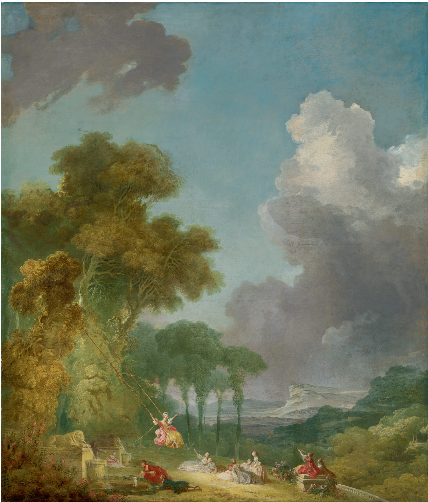
Cat. 41. Jean Honoré Fragonard, The Swing