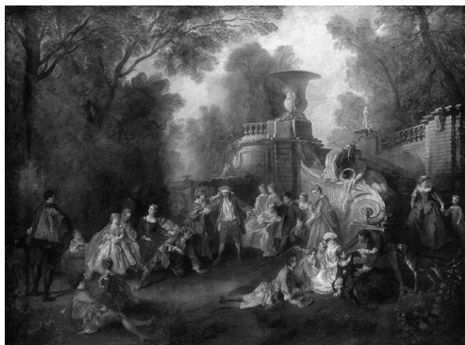
Fig. 5. Nicolas Lancret, The Italian Meal , before 1738, oil on canvas, Berlin, Château de Sans-Souci

H. Fragonard [ sic ]. Five large pictures by this artist, designed and executed to decorate the walls of a salon; they represent diverse landscape subjects with varied and graceful sites, and are embellished with interesting figures. 19