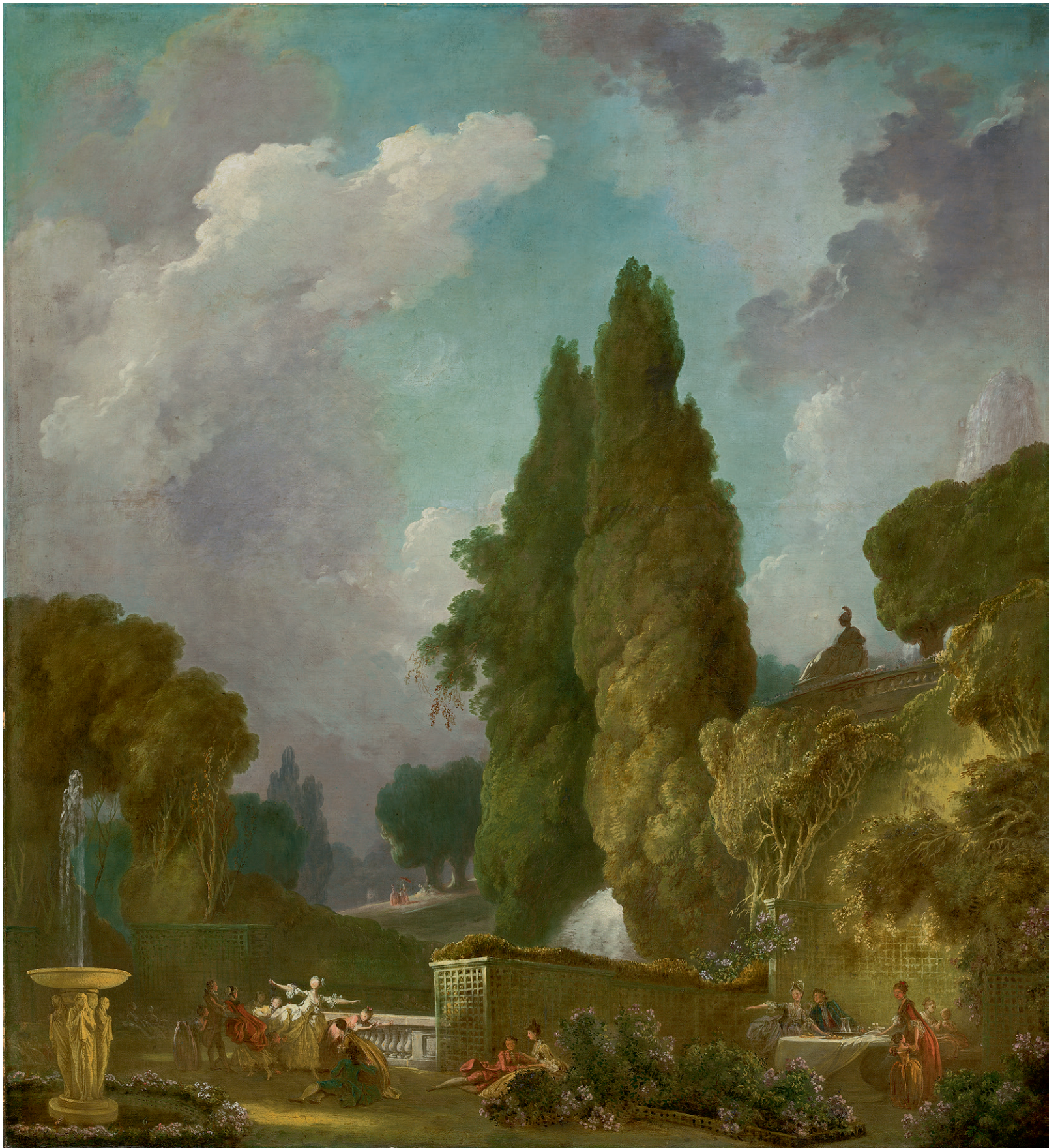
Cat. 40. Jean Honoré Fragonard, Blindman's Buff