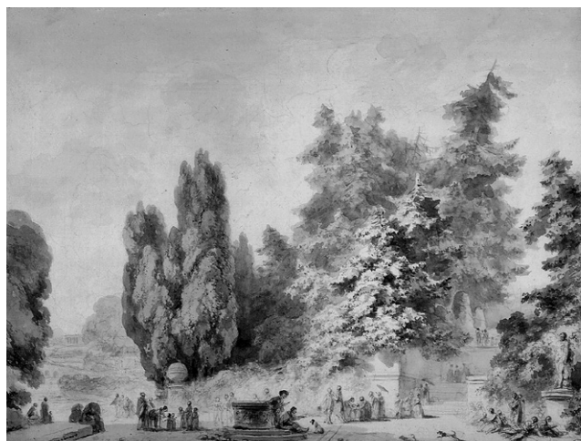
Fig. 2. Jean Honoré Fragonard, A Garden Near Rome , c. 1773–1774, ink wash over black chalk, Paris, Musée du Petit Palais