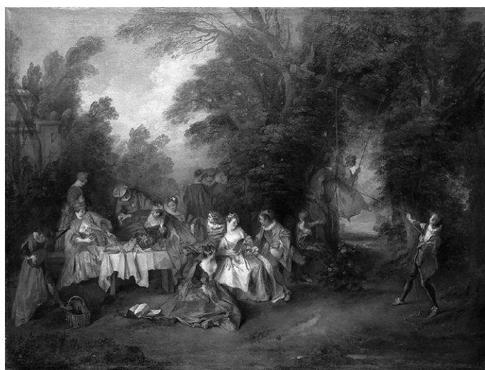
Fig. 4. Nicolas Lancret, Blindman's Buff , before 1738, oil on canvas, Berlin, Château de Sans-Souci

Sets of landscapes often served for interior decoration in the eighteenth century. In the 1770s and 1780s Hubert Robert (1733–1808, cat. 86) was among the most prolific such decorators, creating suites of landscapes and ruin paintings for the interiors of his patrons' hôtels particuliers and maisons de plaisance . 17 Fragonard is known to have painted many decorative pictures, often in pairs or series, but no ensemble survives intact in its original location. 18 Regarding the five garden paintings now divided between the National Gallery and the Banque de France, Paris, Rosenberg has proposed that they may originate from the collection of Marchal de Saincy, whose 1789 sale catalogue describes a group of landscapes as follows: