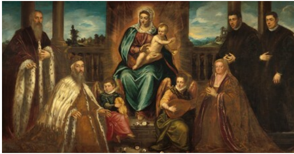
Jacopo Tintoretto Venetian, 1518 or 1519 - 1594