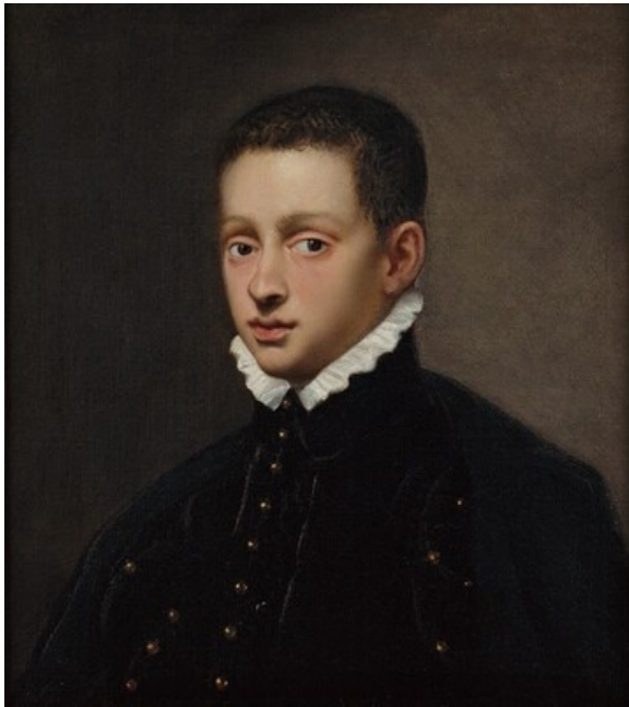
fig. 3 Jacopo Tintoretto, Portrait of a Boy , c. 1575, oil on canvas, Private Collection.