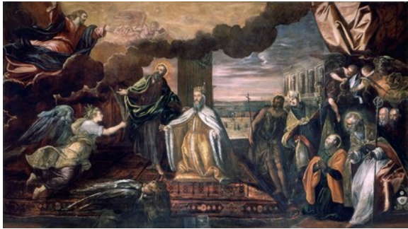
fig. 1 Jacopo Tintoretto and Workshop, Doge Alvise Mocenigo Attended by Saint Mark and Other Saints before the Redeemer , c. 1582, oil on canvas, Palazzo Ducale, Venice.