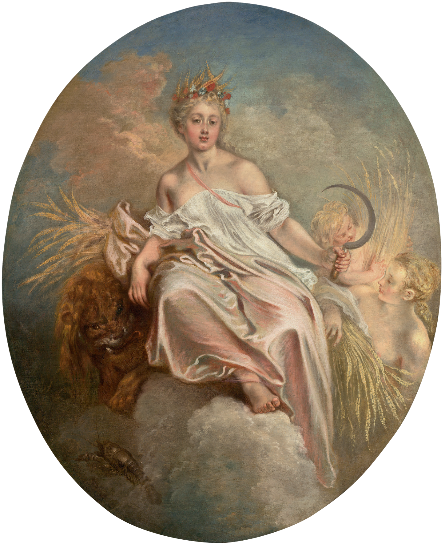
Cat. 98. Jean Antoine Watteau, Ceres (Summer)