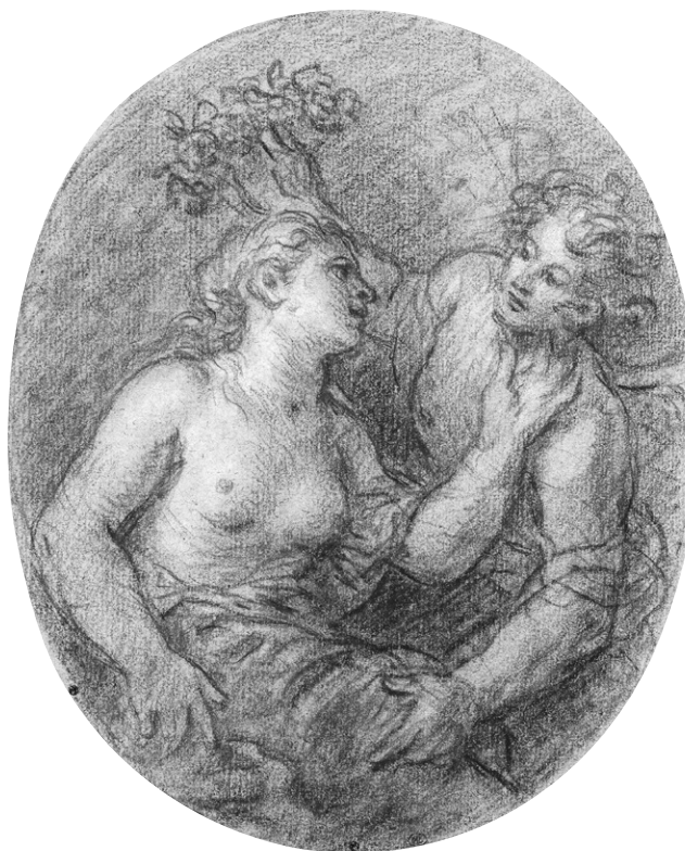
Fig. 6. Charles de La Fosse, Zephyr and Flora , c. 1710, red, black, and white chalk, Paris, Musée du Louvre