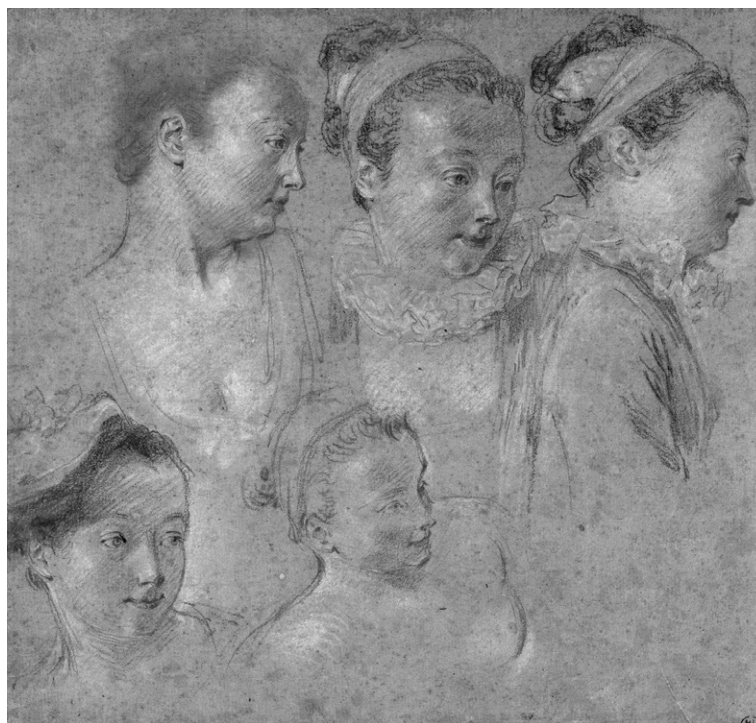
Fig. 5. Jean Antoine Watteau, Studies of a Woman , c. 1715, red, black, and white chalk, Paris, Musée du Louvre