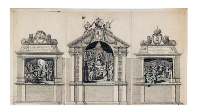
fig. 2 Engraving of a stage erected in 1648 on the Dam in Amsterdam to celebrate the Treaty of Münster, Atlas Van Stolk, Rotterdam