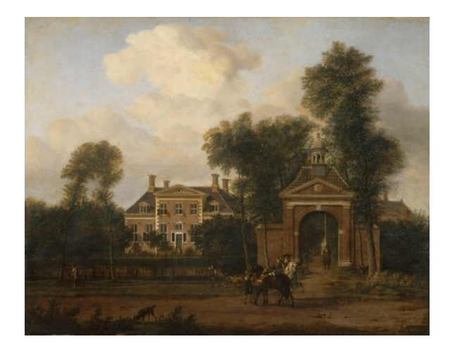
fig. 3 Jan van der Heyden, Harteveld on the Vecht, late 1660s, oil on canvas, Musée du Louvre, Paris.