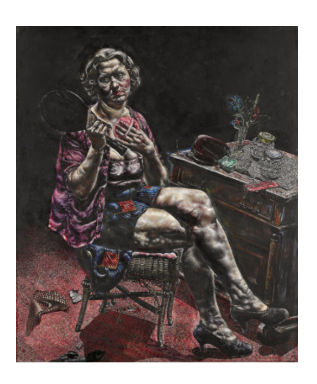
fig. 2 Ivan Albright, Into the World There Came a Soul Called Ida , 1929–1930, oil on canvas, The Art Institute of Chicago, 1977.34