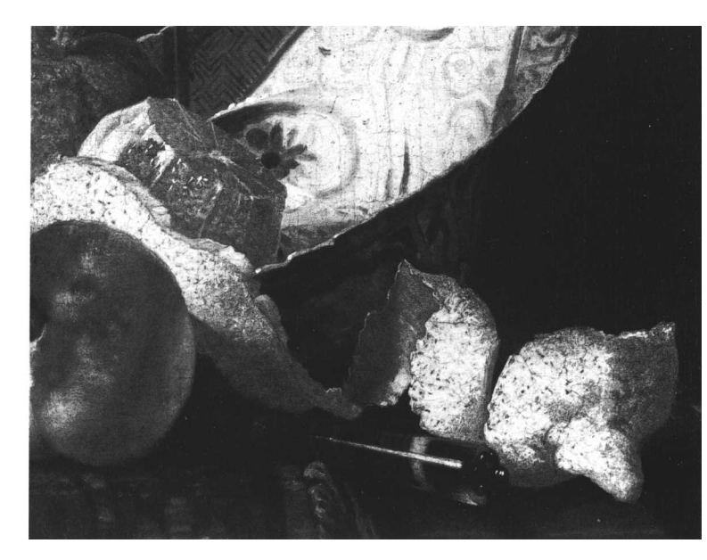
Fig. 2. Detail of lemon in Willem Kalf, Still Life, 1943.7.8

The compositional components of this work indicate that Kalf's original composition was executed in the late 1660s. 11 Although the blue and white Wan-Li porcelain bowl, decorated with colored biscuit figures representing the eight immortals of Taoist belief, is already found in Kalf's paintings from the early 1660s, most prominently in his Still Life with Nautilus Cup of 1662 (Fundación Colección Thyssen-Bornemisza, Madrid),<sup>12</sup> the unusual nautilus cup appears only later in the decade. 13 This cup consists of a polished turban shell mounted on an elaborately wrought, gilded-silver base made in the form of a putto holding a horn of plenty.<sup>14</sup> While the turban shell was particularly prized for its mother-of-pearl luminosity, its shape, with the symbolic association with a horn of plenty, made it a particularly appro-