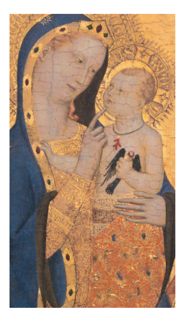
fig. 1 Detail of Madonna and Child (central panel), Puccio di Simone and Allegretto Nuzi, Madonna and Child Enthroned with Saints and Angels , 1354, tempera on panel, National Gallery of Art, Washington, Andrew W. Mellon Collection