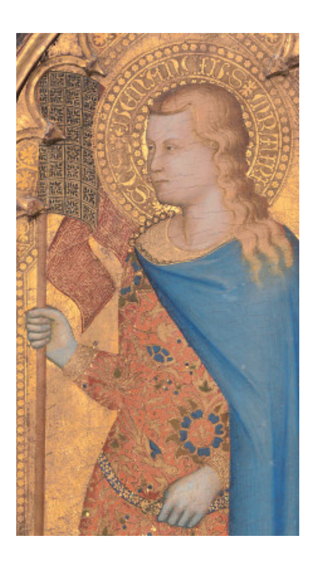
fig. 3 Detail of Saint Venantius (right panel), Puccio di Simone and Allegretto Nuzi, Madonna and Child Enthroned with Saints and Angels , 1354, tempera on panel, National Gallery of Art, Washington, Andrew W. Mellon Collection