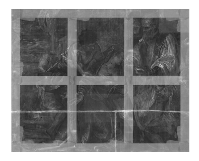
fig. 1 X-radiograph, Veronese, The Martyrdom and Last Communion of Saint Lucy , c. 1585/1586, oil on canvas, National Gallery of Art, Washington, Gift of The Morris and Gwendolyn Cafritz Foundation and Ailsa Mellon Bruce Fund