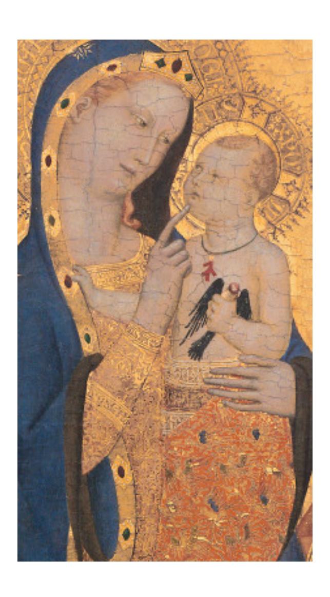
fig. 1 Detail of Madonna and Child (central panel), Puccio di Simone and Allegretto Nuzi, Madonna and Child Enthroned with Saints and Angels , 1354, tempera on panel, National Gallery of Art, Washington, Andrew W. Mellon Collection