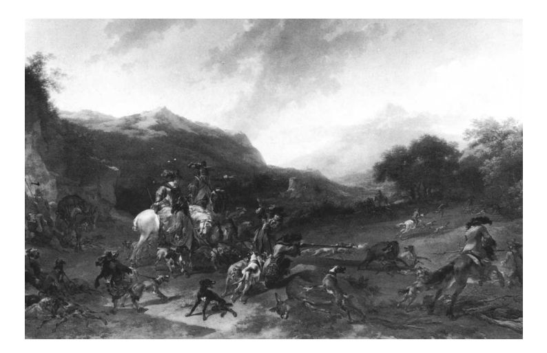
Fig. 2. Nicolaes Pietersz. Berchem, Wild Boar Hunt, 1659, oil on canvas, The Hague, Mauritshuis

that Berchem's work underwent between the late 1650s and early 1660s. Here one encounters a comparable contrast between foreground figures and a distant vista of cliffs across a body of water, but the foreground and background elements are not as closely integrated. Not only are distinctions of light and color more pronounced, but also the careful interplay of horizontals, verticals, and diagonals found in View of an Italian Port have not been so