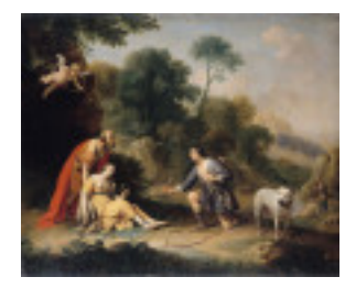
fig. 1 Herman Saftleven, Silvio and Dorinda, 1635, oil on canvas, Gemäldegalerie, Berlin.