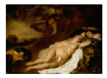
fig. 2 Jacob Backer, Cimon and Iphigenia , c. 1640, oil on canvas, Herzog Anton Ulrich Museum, Braunschweig