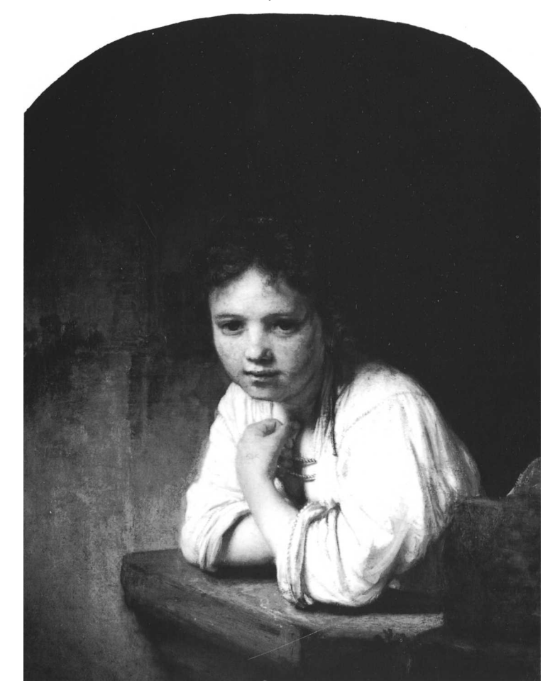
Fig. 1. Rembrandt van Rijn, Girl at a Window , 1645, oil on canvas London, Dulwich Picture Gallery

ing is eighteenth-century in origin.<sup>8</sup> Since A Girl with a Broom has a distinguished provenance that reaches back to 1678, when it is almost certainly listed in the inventory of the collection of an acquaintance of Rembrandt, Herman Becker, the latter suggestion is clearly unacceptable. Even though the painting was attributed to Rembrandt when it was in Becker's collection, its style differs in enough fundamental ways from that of Rembrandt's authentic paintings to warrant the doubts mentioned in the literature.