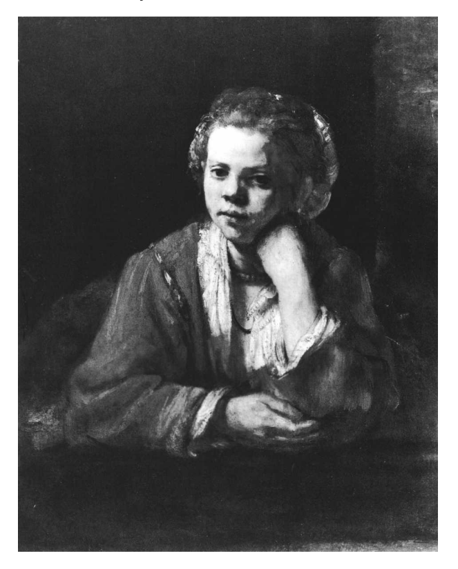
Fig. 5. Rembrandt van Rijn, Servant Girl at a Window, oil on canvas, 1651, Nationalmuseum, Stockholm

Few specifics are known about the nature of Rembrandt's workshop in the late 1640s and early 1650s. Samuel van Hoogstraten (1627–1678) in his Inleyding