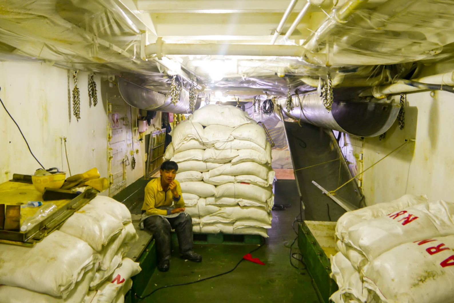
Salt bags for brine stored in a purse seiner.

Purse-seine vessels. For the 253 vessels in the FFA register: